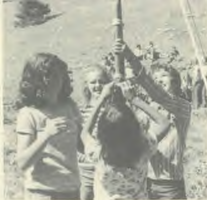
The Alamogordo Tomahawk Pathfinders lash and raise a three-section flag pole in the 1977 Texico Camporee.