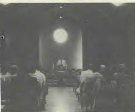
Everman church organized September 9, 1978