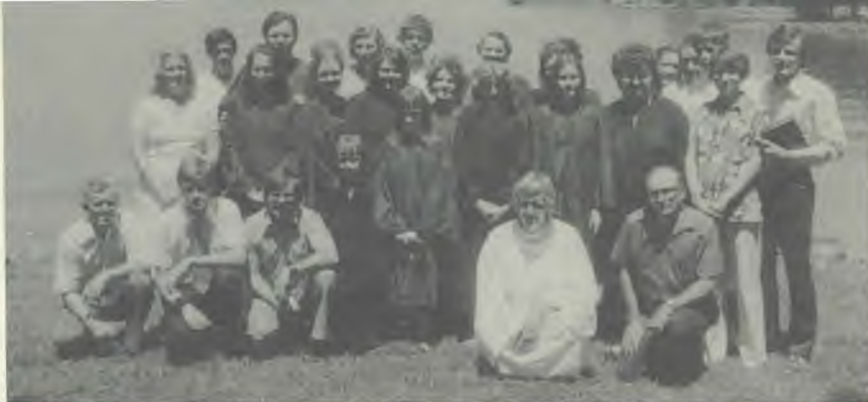
Twenty five who were baptized on July 29 in Russellville, Arkansas.

The members of the Russellville church are quite crowded in their church building lately. The crowded conditions