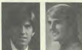
(Left to Right)

TWO MONTHS CLEARED FOR EVANGELISM IN 1979. The local conference officers and Southwestern Union officers have agreed to clear their calendars of all boards, committees, and other meetings for the months of April and September 1979 so all staff members can conduct evangelistic meetings and not have other things interfering. A huge step in the right direction.