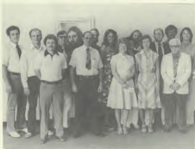
CTA staff members

LARD IN EVERYTHING? Most store-bought cookies, crackers, cakes, breads, pies, and other pastries today contain lard. To be informed check the label. The law requires that all ingredients be listed. Some few brands contain only vegetable shortening or oils. In light of God's counsel regarding such foods it could be a blessing in disguise.