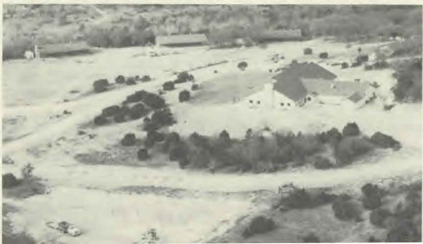
Recent aerial view of Nameless Valley Ranch showing excavation for new swimming pool. Mock Cafeteria is in center with cabins in background.