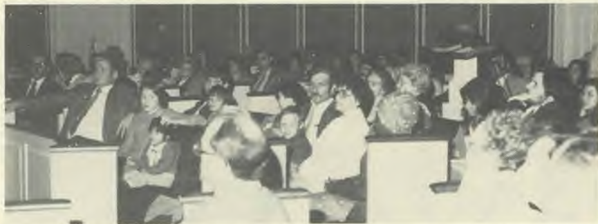
Part of congregation attending recent Corpus Christi area conference rally. The afternoon meeting was held in the beautiful St. John Methodist Church.