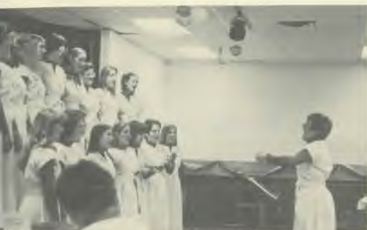
The Cantamos, a select choir of the Austin First Baptist Church, sings at the Christmas banquet for the Austin Seventh-day Adventist Church.