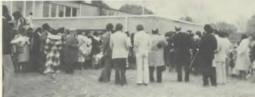
Berean church gathers at ground-breaking in Baton Rouge.