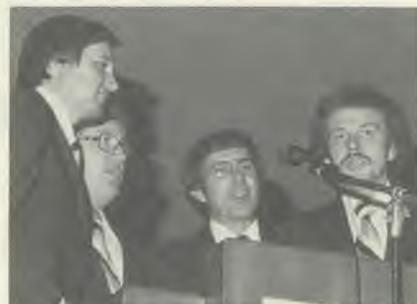
King's Heralds Quartet sings.

Approximately 2,400 persons attended the Voice of Prophecy Golden Jubilee meeting.