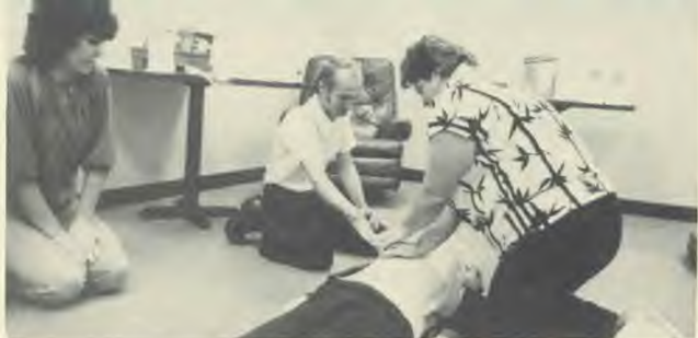
A certified CPR instructor, center, teaches a student, right, from a local industry the proper hand position as she practices CPR on a special teaching dummy at Huguley Hospital.