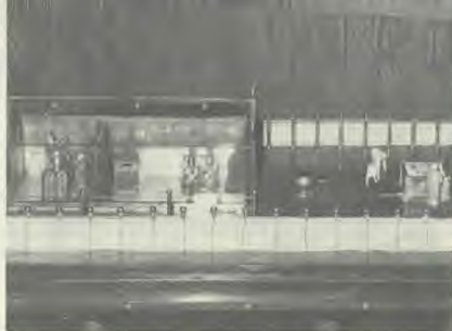
Court, first and second apartments of sanctuary are shown in detail at display during evangelistic meetings in Killeen church.