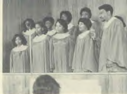
Youth choir presents music for the telecast.