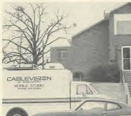
Cable television mobile unit stands in front of Philadelphia church in Shreveport. E. L. Howard is the pastor.

Cable television is a marvel of our day. A flip of the switch will enable an entire city to tune in and watch a program beamed to the masses in the privacy of their home. The Adventist Youth