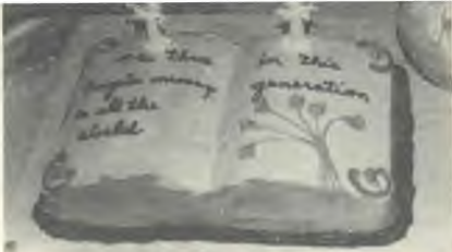
The unique cake.

a high spiritual note with all those present determined to be part of the remnant group.