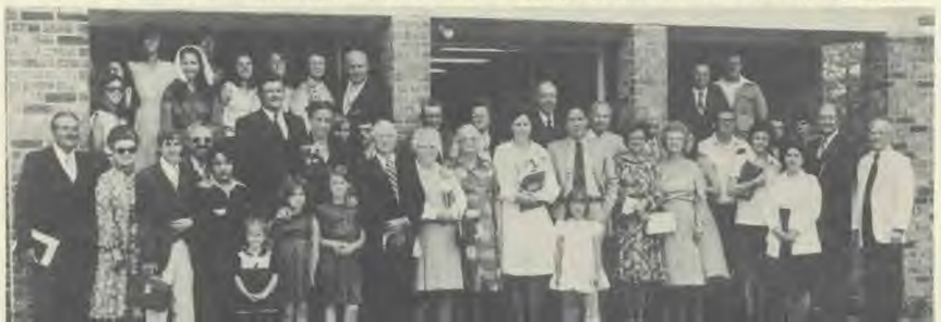
Jackson church members as they met for the dedication of their church on May 10, 1980.