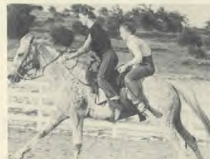
Having fun at NVR is being rescued Indian style.