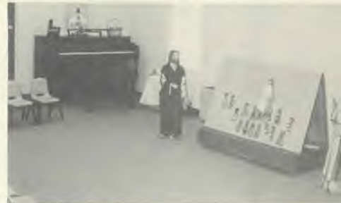
One of the new Sabbath School rooms in new Burleson church.