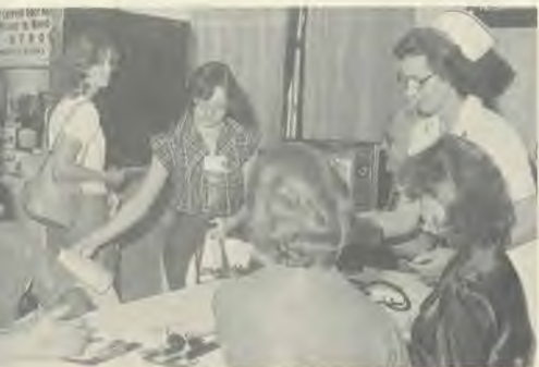
"Westbrook Hospital" (Faith for Today) exhibit at National Cable Television Association Convention in Dallas. Local volunteers assist in the exhibit.