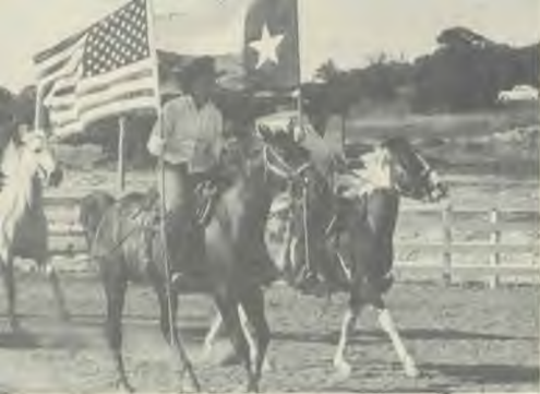
Having fun at NVR is watching a parade.