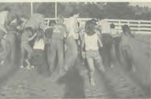
Having fun at NVR is hunting your shoe.