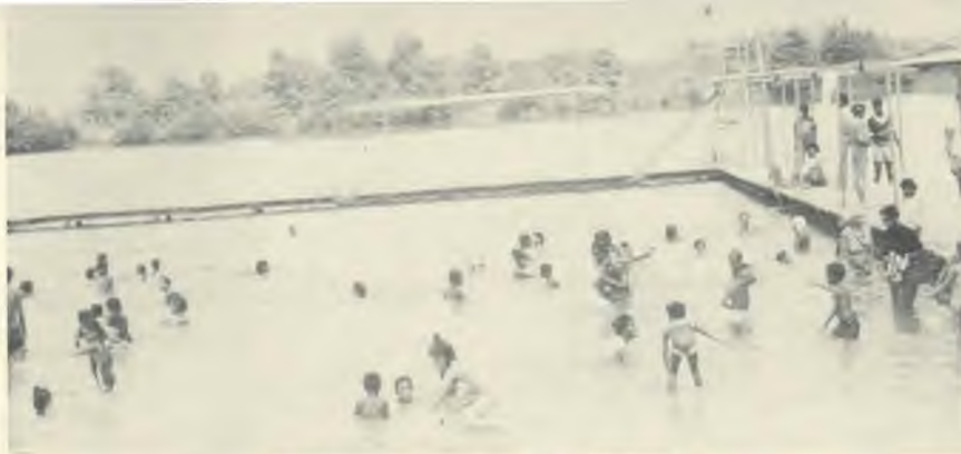
The youth enjoy recreation and swimming.