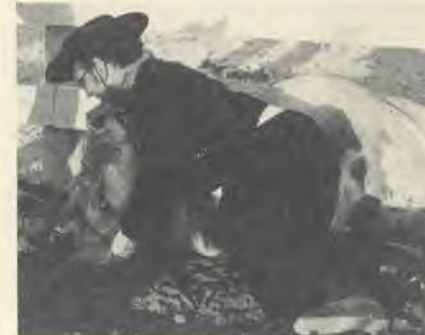
... Even the camp superintendent gets into the act.