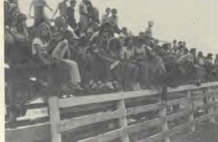
Having fun at NVR is watching a rodeo.