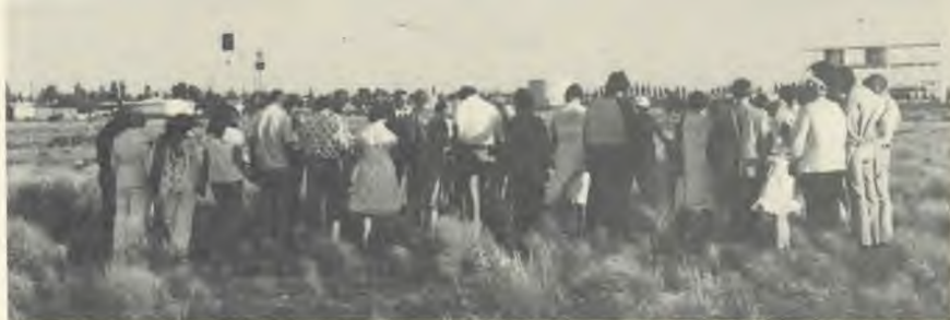
Members and friends of the Central church join in a circle of prayer, dedicating themselves to build a new church.

In a special vesper service on May 31 the members and friends of the Albuquerque Central church met at the new church site to dedicate themselves to the building of a new house of worship. Located close to the intersection of I-40 and Coors Road, the new church will have more than 15,000 square feet and a seating capacity of 400. It includes a fel-