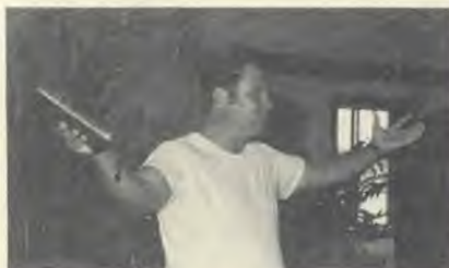
Having fun at NVR is listening to stories by our chaplain.