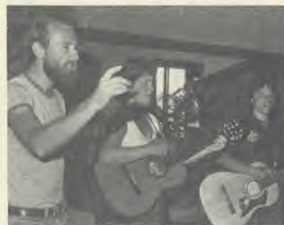
Having fun at NVR is singing songs about Jesus.