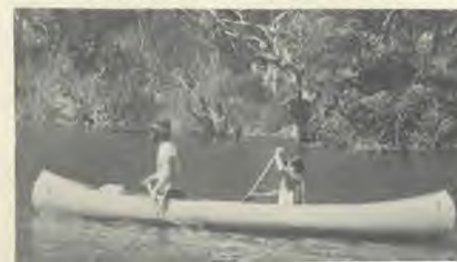
Having fun at NVR is canoeing.