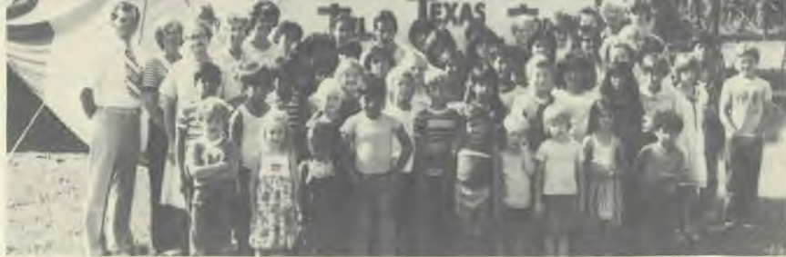
June 7-21 the Fredericksburg, Texas, church used a conference tent to hold morning vacation Bible school sessions and evening evangelistic meetings. There were 58 children enrolled in the VBS. The program concluded with a baptism of four people and several new visitors attending church.