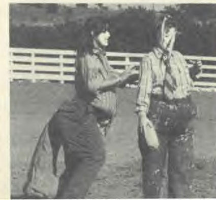
Having fun at NVR is watching clowns have fun.