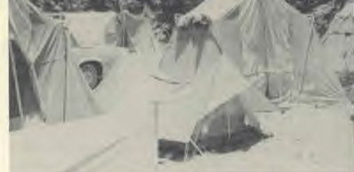
Beautiful tents pitched by the Pathfinders during camporee.