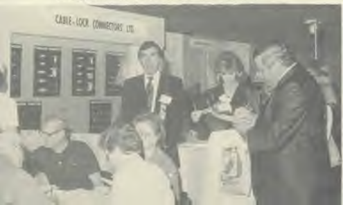
"Westbrook Hospital" exhibit in action. Blood pressure checks are taken by Outpost Evangelism Group at the exhibit. Several cable TV operators asked for use of "Westbrook Hospital" series on their outlets.