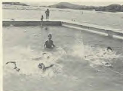
Going to junior camp at NVR is learning to swim.