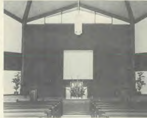
View of rostrum in new Burleson church.