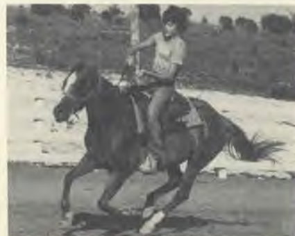
Having fun at NVR is barrel racing.