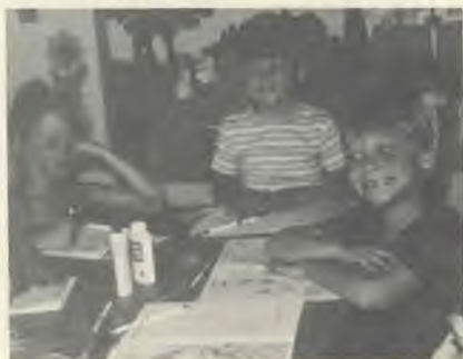
Young people attending the Duncanville vacation Bible school enjoy coloring Bible story pictures.

As a follow-up, a Neighbor Bible Club was started at the church June 14, with 18 attending.