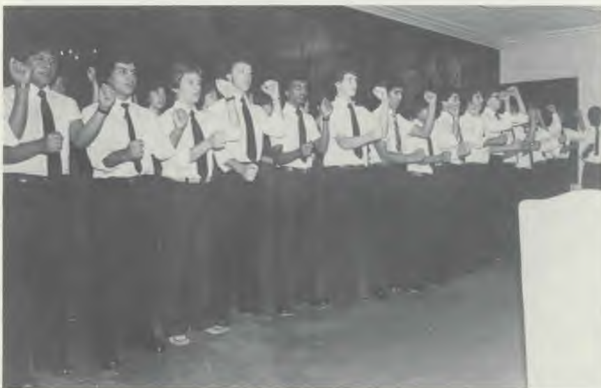
Boys in the Valley Grande Academy Bell Choir imitate bell ringers as they sing during a concert for the Hidalgo County Bar Association Christmas banquet on December 10. In the audience were many of the most prominent lawyers, judges, and politicians in south Texas.