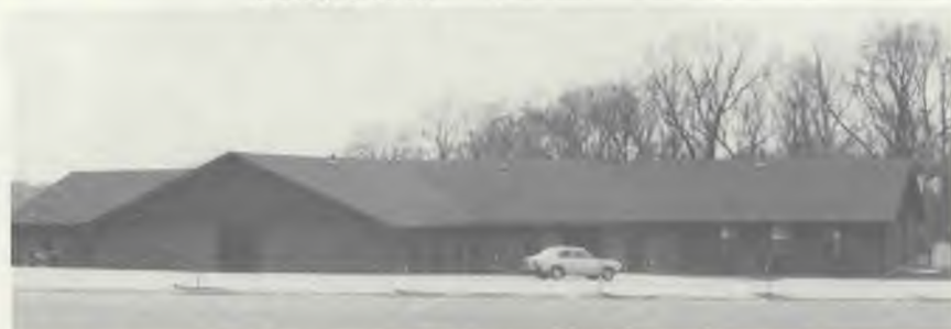
New Ozark Elementary School which was constructed and ready for occupancy in just seven months.

On December 19 the church had decorations to fit the holiday season including a tree for the Sabbath School offering device. The main feature of the program included a nativity scene with costumed children and appropriate props. It was beautiful, well planned, and inspiring.