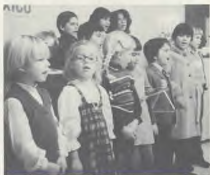
Children of ministerial families present special music at the special supper.