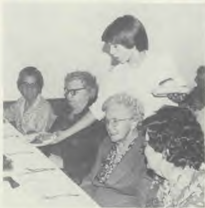
Young people served as waiters.