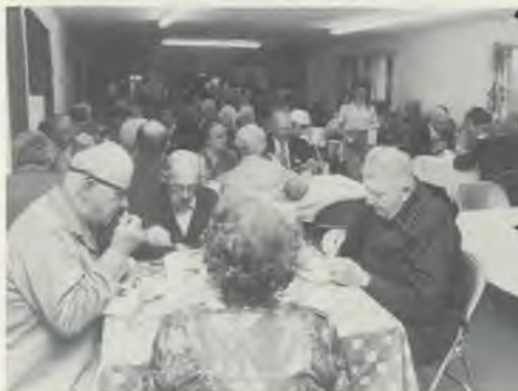
A happy group of senior citizens, entertained by the Choctaw church.