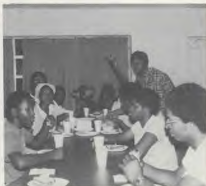
Berean youth during "lock-in."