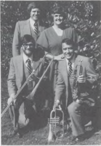
The Belko Brass

General Conference in New Orleans. Her story will set your soul afire.