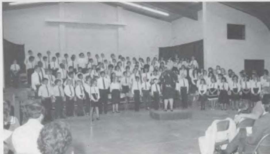
Festival Choir in sacred concert.