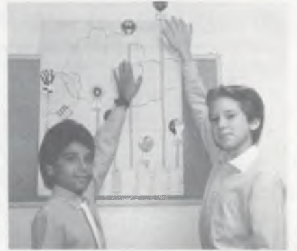
Two Richardson boys given hot air balloon ride.

One of the special features of the Richardson Earliteen Sabbath School class has been the study of air transportation. They used a hot air balloon goal device to give points for Bible lesson study, Bible verses memorized, bringing their Bibles to Sabbath School, and arriving on time. Two boys were given a hot air balloon ride in recognition of their high scores.