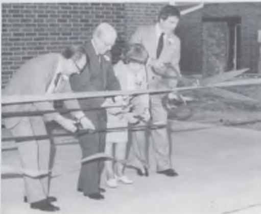
After the dedication service the official opening of the wing came with the ribbon cutting ceremony.