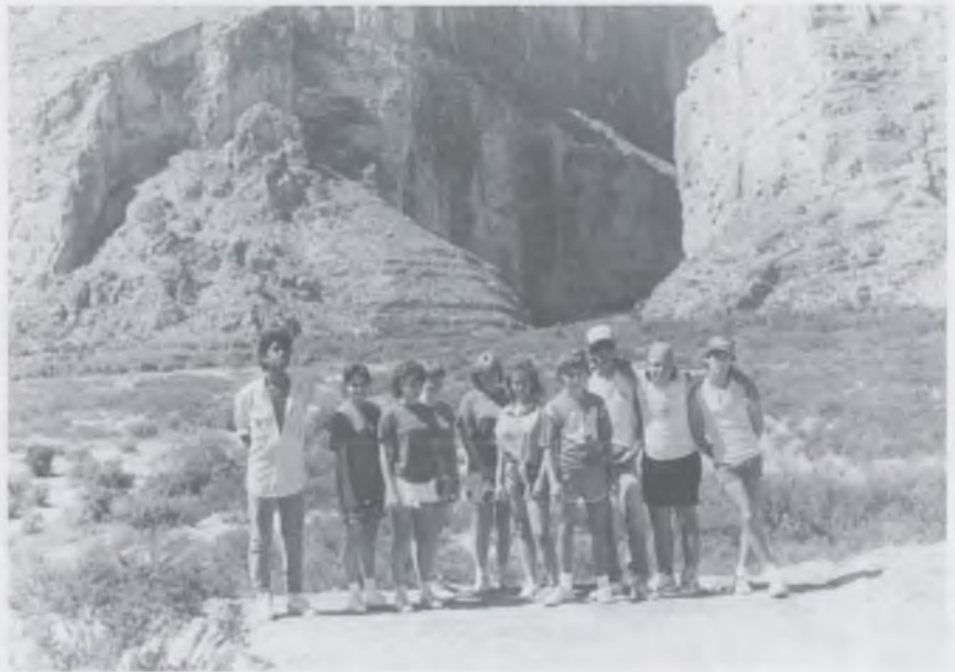
Parkview Adventist Academy students on their Wilderness Living campout.