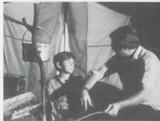
The Seminar at Camp Yorktown Bay was conducted to help Pathfinder leaders sharpen their skills.

Also accomplished at this gathering was the division of conference Path-