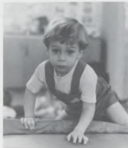
A new Kidd's Club at the Huguley Health Fitness Center is helping parents and kids improve their health.