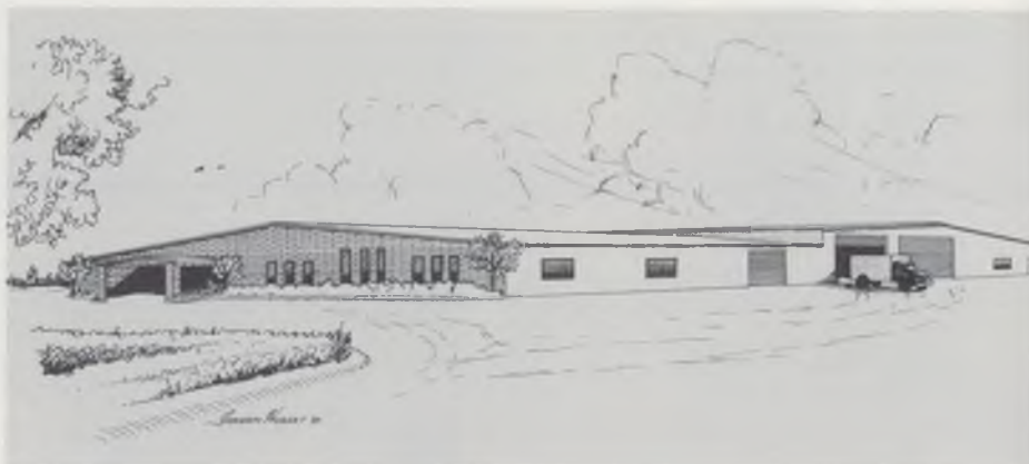
Artist's rendering of new Community Services Depot.