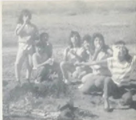
Girls' potato bake.