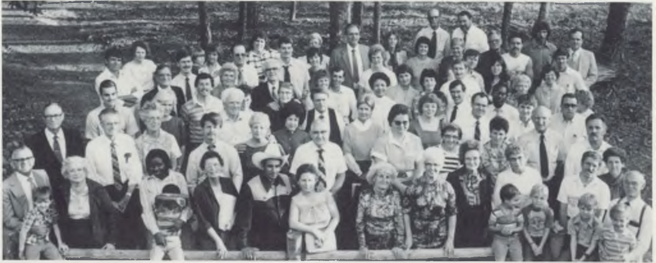
The group who participated in last year's Lay Rally.