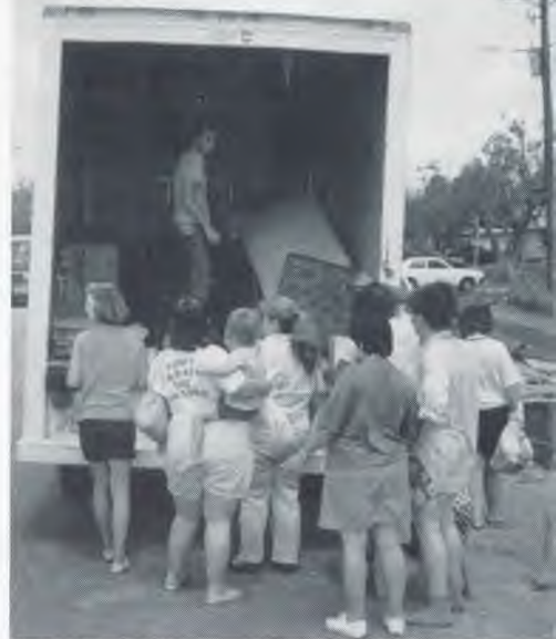
Ardmore students as they unload supplies near Houma, Louisiana.