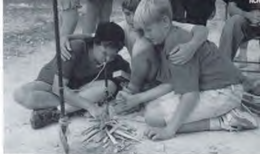
It's a tough job to light a fire without matches!

Clubs spent all day Friday participating in events which ranged from traditional Pathfinder events, such as fire building, first-aid, and drilling and marching to fun events such as the "human log roll," paper airplane flying and the "old clothes relay."