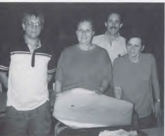
Participants of the Breathe Free program who put their cigarettes in the mini-casket.