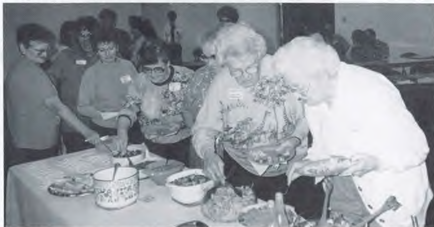
NEWSTART seminar participants test food samples.

The Texico Conference and members of the Abilene and Big Spring churches are pleased to welcome this new pastoral family.