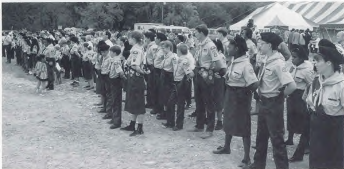
"Stand at ease!" and all 1,650 Pathfinders and their leaders obey instantly.