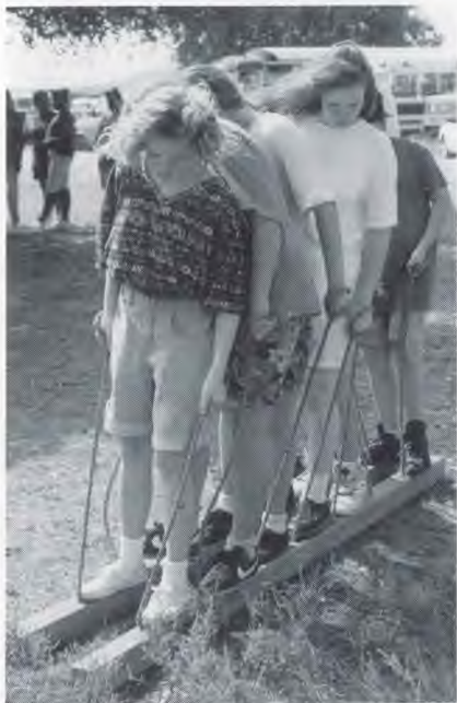
Pathfinder girls agree on which foot to put forward first.