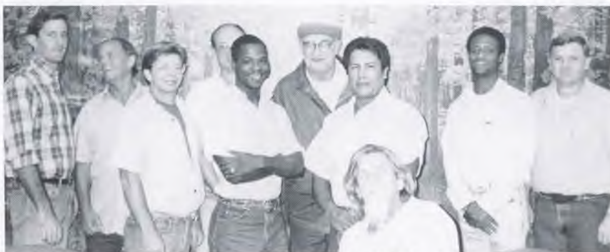
A group of inmates in Lexington, Oklahoma, who were helped by a five-day stop-smoking seminar held by local Adventists.

Oklahomans look past the negatives of Ingathering—large goals, small towns, and a depressed economy—and to the positives. They concentrate on the willing church members and the joy that is spread to those they meet. Many feel that this is the reason that they have reached their goal this year.