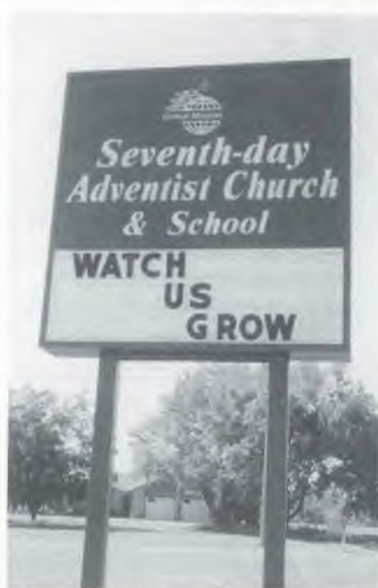
This new 16-foot sign allows the Enid Seventh-day Adventist church to witness to the thousands of people who pass by each day. The sign is located on the site where the new church will be built.