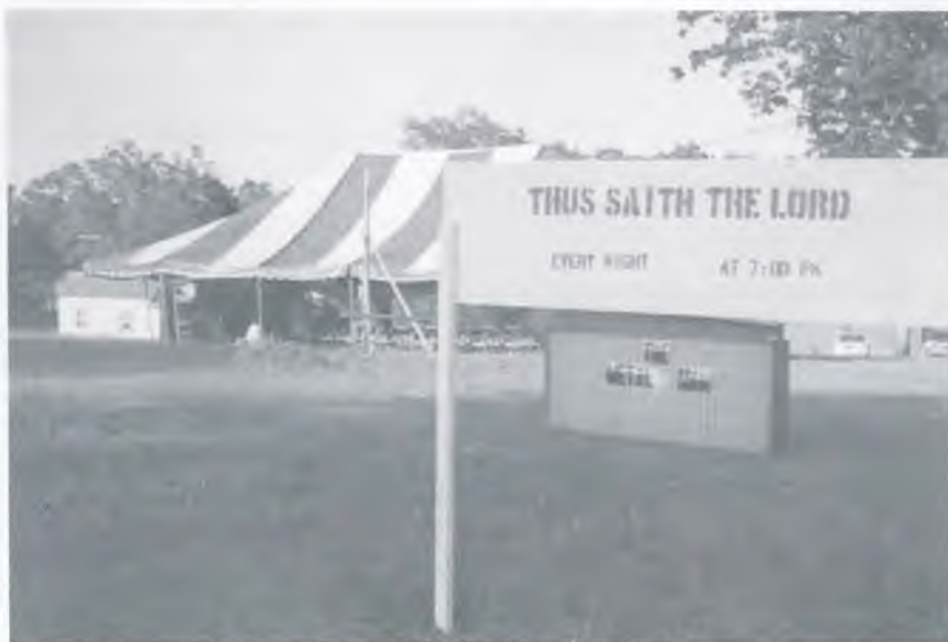
The tent where Palestine church members held their "Thus Saith the Lord" tent meetings, bringing in 30-50 visitors per night.