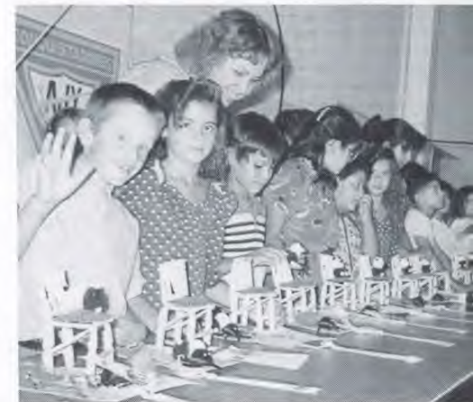
Participants in the North Valley Spanish church in Albuquerque, New Mexico, Vacation Bible School, held August 3-8, display crafts they made.

The Pathfinders spent October 14-18 at the Southwestern Union Conference Camporee at Nameless Valley Ranch. All 50 members of the club traveled 17 hours each way to participate in the gathering of Pathfinders from all over the union.