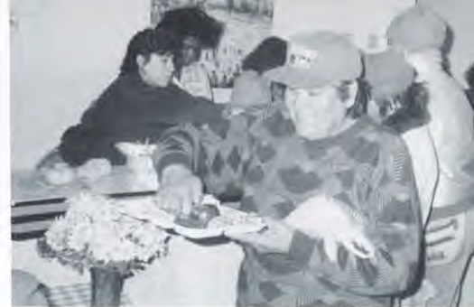
One of over 150 homeless people fed by Project Share in Albuquerque, New Mexico.

The Pathfinders of the North Valley Spanish church in Albuquerque, New Mexico, find that the best way to keep busy and have fun too is to help others. In the past three months, this Pathfinder club has been involved in com-