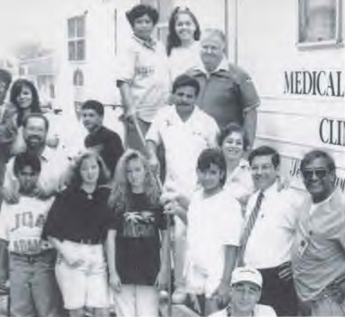
Professionals and volunteers from the New Orleans Spanish church offered mobile medical van services to the community on July 22. They administered tests for high blood pressure, glaucoma, cholesterol, and glucose levels.