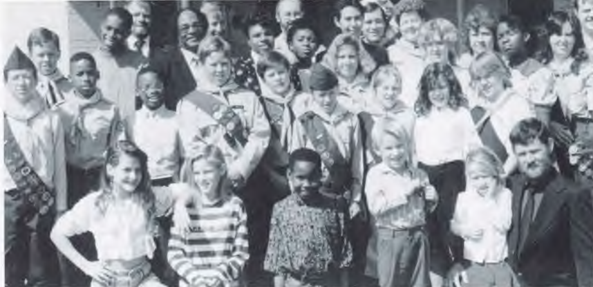
The Cherokee Champs Pathfinder Club