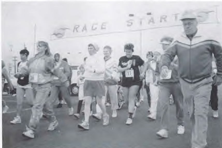
Walkers are off at a fast pace to start this year's 7th annual Silver Classic 5K Walk/Run sponsored by Metroplex Hospital and Killeen Adventist church.