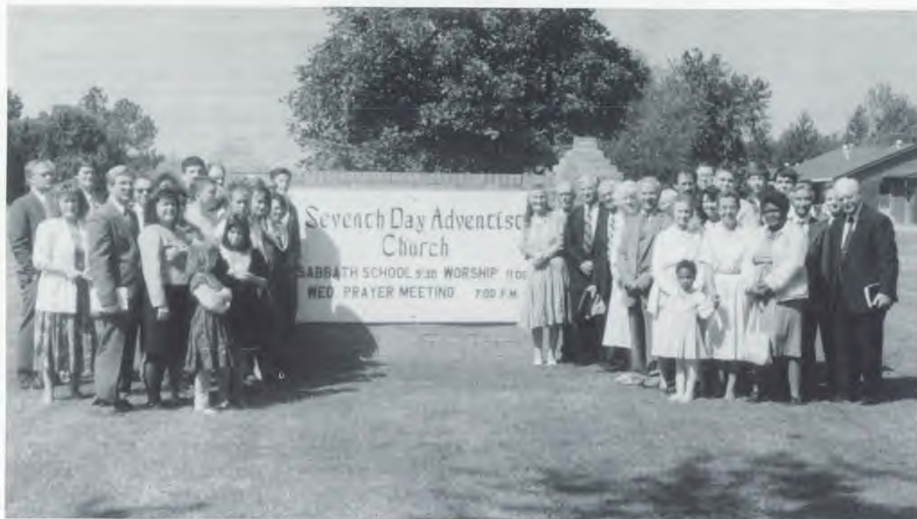
Wilburton members and friends on the day the church was officially organized as a church.