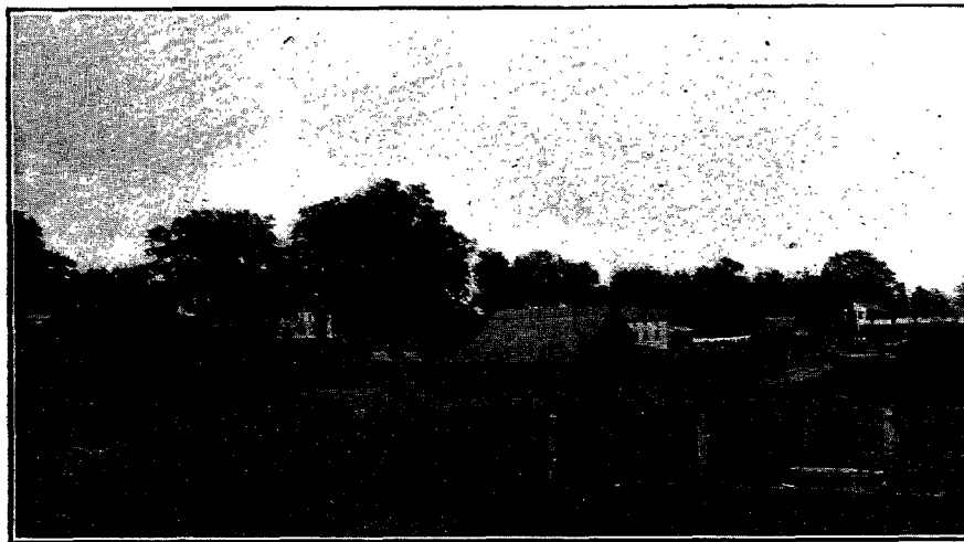
View of Huntsville School Grounds

"We plead for the money that is spent on needless things. Through the self-denying efforts of God's people others will be brought into the faith, and these in turn will help to