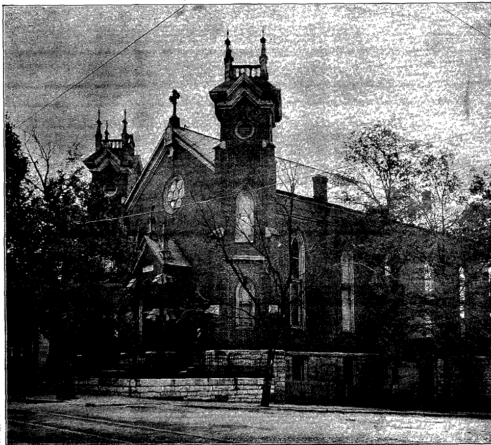
Nashville Memorial Church, Corner Fatherland and Fifth Streets East Nashville