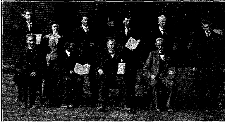
Those who won out on the proposition of selling $1,000.00 worth of books or putting in 1,600 hours' time during the year.

"If you wish to have the qualities of a great man, be modest in success and courageous in failures."