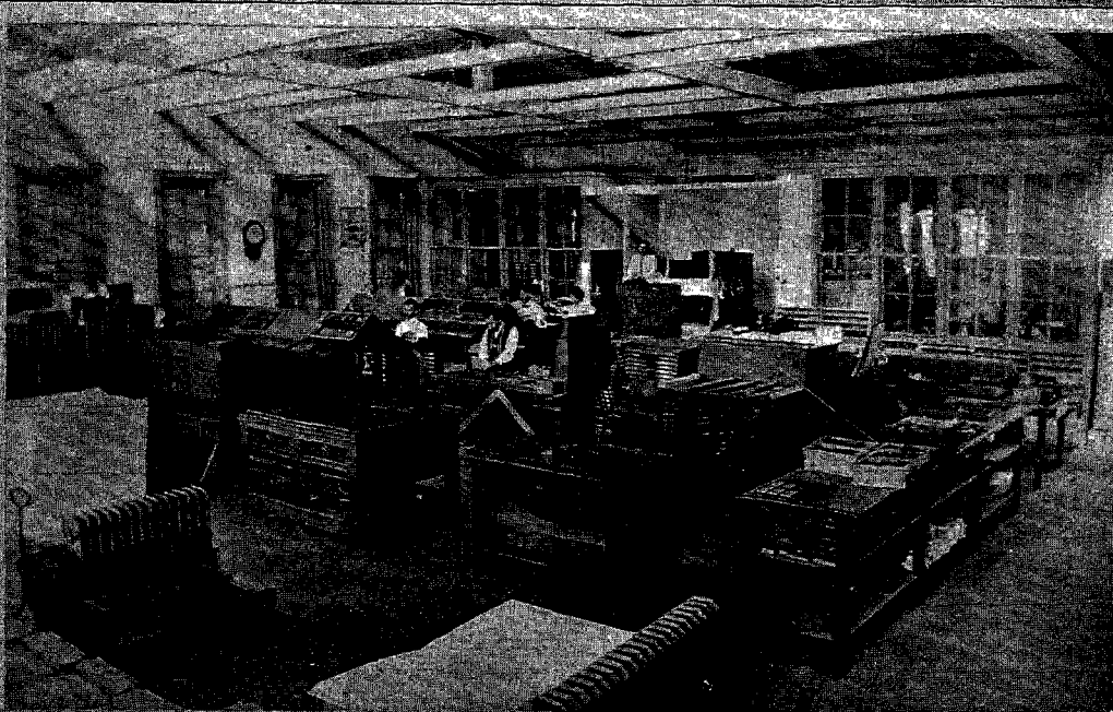
Composing-room, Southern Publishing Association