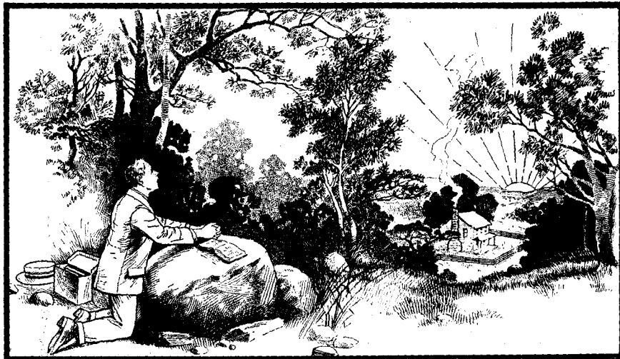
The faithful, consecrated, God-fearing Colporteur taking his Orders for the Day

in fact in all walks and conditions of life, as does the colporteur. He carries the message where the living preacher cannot go; and, from the crowded cities to the isolated mountains, hills, and valleys, he hunts for souls, with the blessed assurance that "canvassers who go forth in