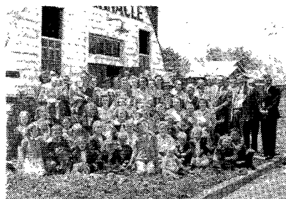
Members and children in the newly organized church at Hazelwood, N. C.