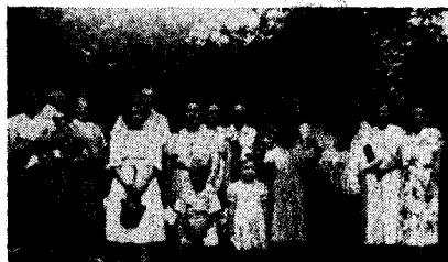
Branch Sabbath School at Marietta, Georgia