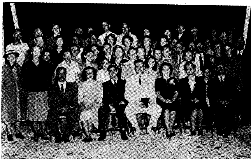
Part of the Number Who Took Their Stand for the Truth in the Sarasota, Florida. Effort. Workers are Seated in the Front Row.

in Sarasota a year ago to join us on a Sabbath morning now. The church membership has more than doubled, and the attendance is really remarkable. One Sabbath I noticed on the Sabbath school bulletin board these facts: Attendance one year ago, 45; Attendance today, 126. We thank God for His Spirit that has made possible these figures.