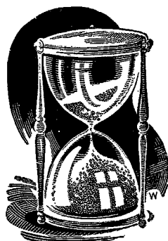
The sands of time are nearly run.

in my way. I have a happiness and joy in my heart that I have never known before. Pray for me that I may be faithful."