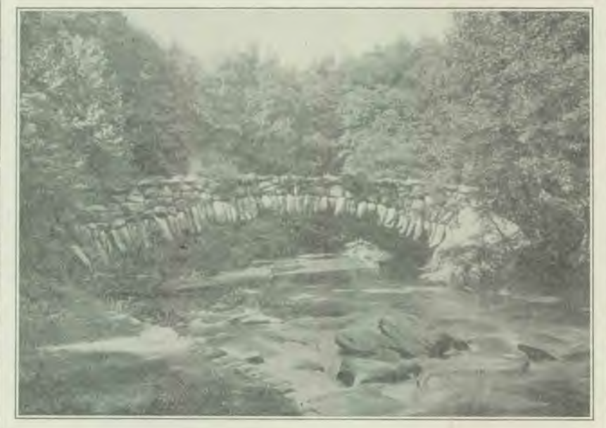
A Scene in Rock Creek Park Near the College

There will probably be ten college graduates this year.