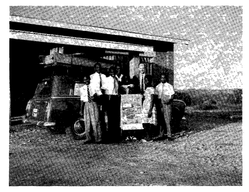
Branch Sabbath-school officers setting out from Bugema Missionary College, Uganda.

Literature-Evangelists Rally Day . . . April 9.