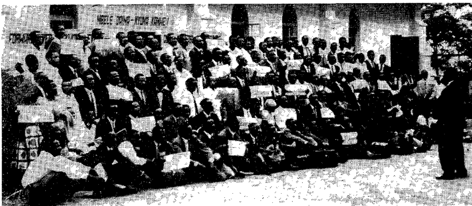
Literature-Evangelists at Ikizu Publishing Rally.