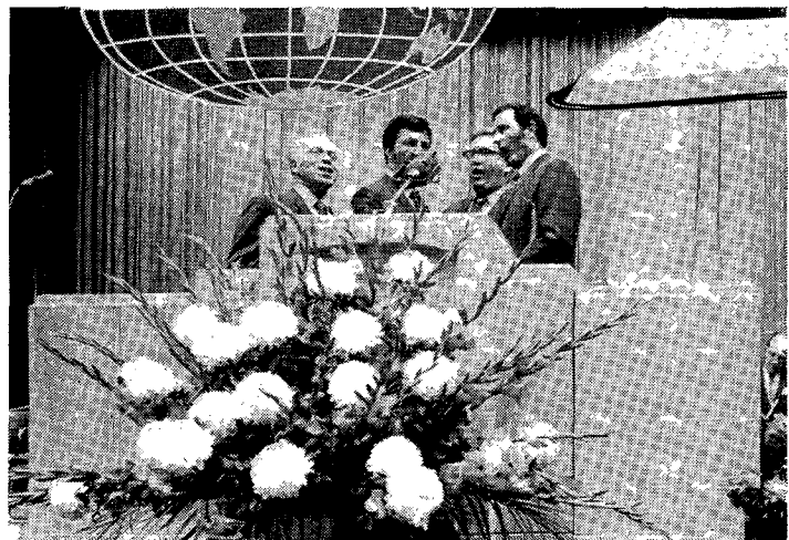
The King's Heralds are still firm favourites.

Basically the system consists of a battery of slide projectors which flash colour pictures on a multi-frame screen as cued by a computerized tape. The North American Division used 26 projectors. The screen was made up of three large frames, maybe 20 feet square, and six half-sized screens, 10 feet square. Sometimes the three large screens were used for wide panoramas with tremendous ef-