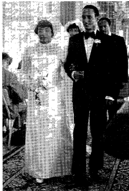
An Abyssinian delegate chose to marry at the Session.

fect. With nine pictures on the screen at once all kinds of combinations can be and were used. For example, the three large screens carried at one time three union conference offices. Below each picture on the smaller screens were flashed pairs of slides—the president's portrait and his name and union. Three facts of three unions would thus be before the audience at the same time.