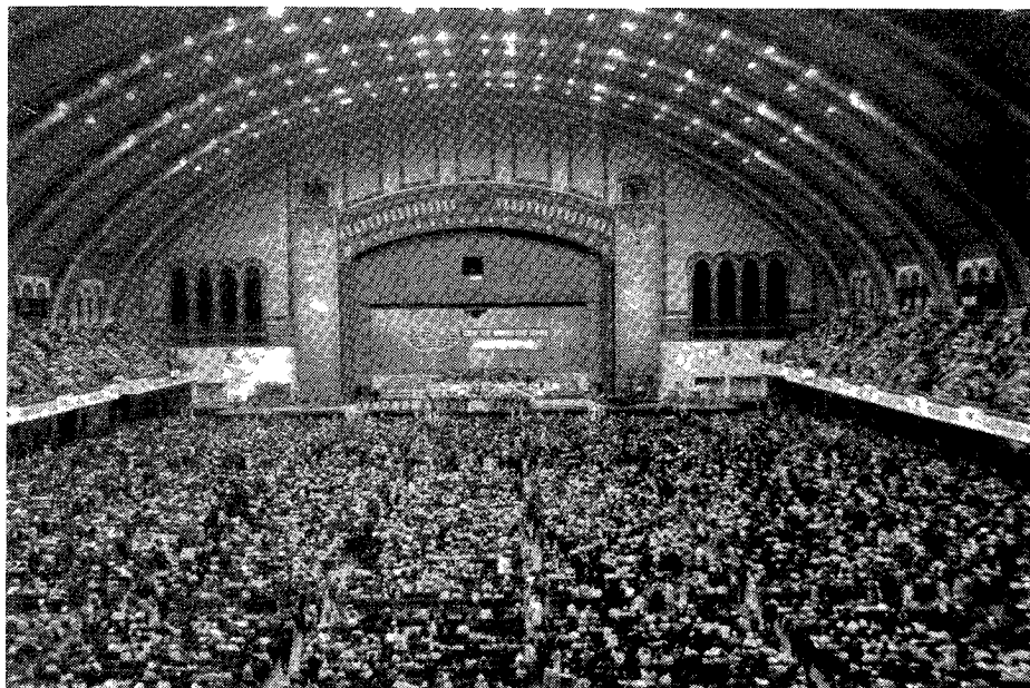
Convention Hall, Atlantic City, where delegates to the 51st Session of the General Conference assembled.