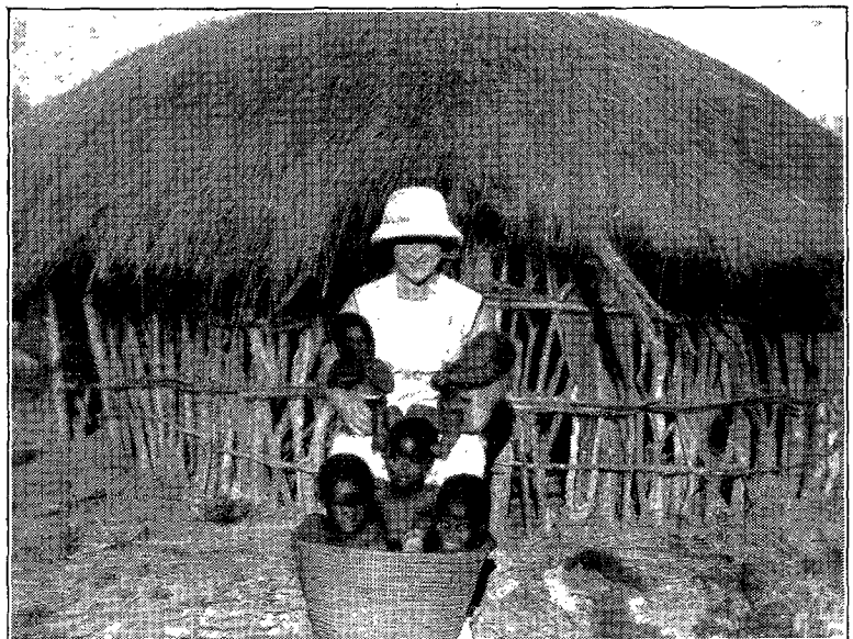
Little piccaninnies of East Africa. The infant mortality in the land is terribly high.