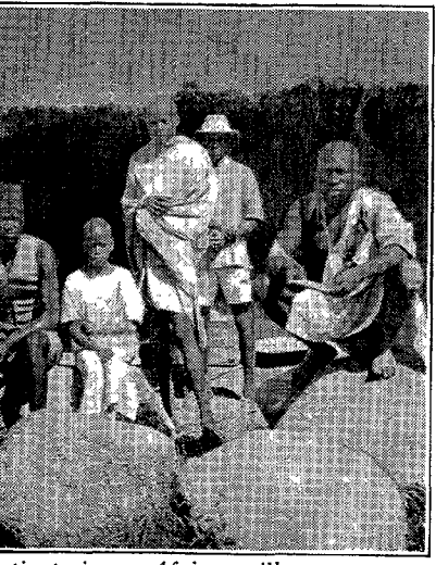
atients in an African village.

"We are getting quite good surgical cases in the wards. A few days ago I removed a very large spleen from a boy about twelve years of age. He stood the operation well and is progressing nicely. I have a similar case next week. We are also starting a maternity school in a small way. When it develops we can call upon the government for help in erecting a small maternity department. I am anxious for this work to develop, for it means a lot. It reaches the women and reaching them means a great deal." E. M. E.