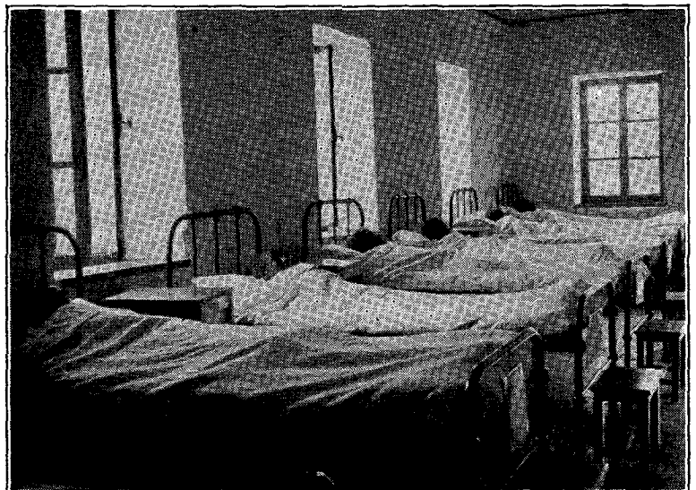
Interior view of the Dessie Hospital, Ethiopia.

Very often people who are very ill and who have been suffering for some years come for help. They are encouraged to remain in the hospital where they will receive