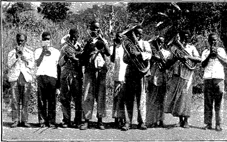
Suji (East Tanganyika) students' brass band, which welcomed Brother Strahle to the mission.

ber of the people are now able to read, which makes it possible to distribute literature in some places.