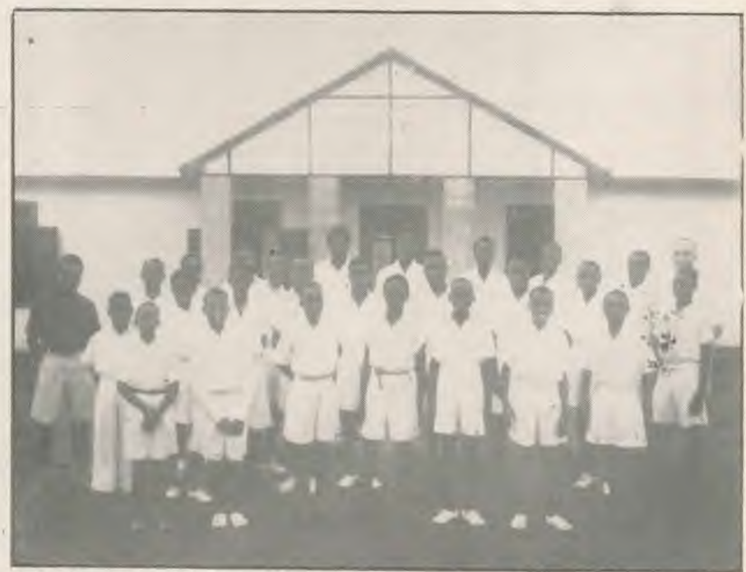
First Secondary School class, Ihie, The dawn of a brighter day for our Nigerian youth.