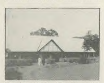
One of present Boys' Domitories, Bekwai. Additional Dormitories are planned under the expansion programme.

In all of our mission fields it was planned to bring the programme in the schools into closer harmony with the pattern of true education, as pointed out in the Spirit of prophecy. emphasis brought forward the importance of a strong improvement in the teaching of the Bible classes in all schools. In the Training it included the addition of certain practical subjects. Another two years of training was to be added, at a suitable time, to the present