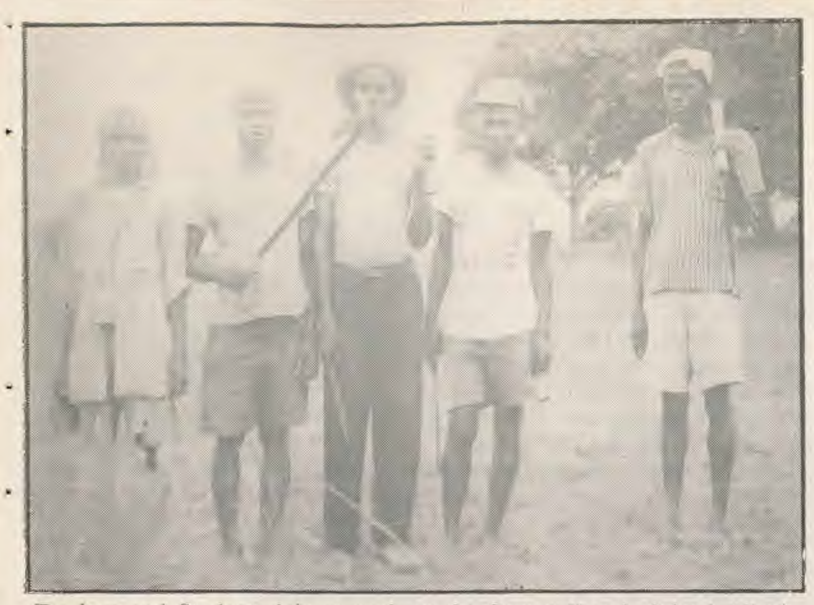
Teachers and Students join at work on the farm at Konola School, Liberia.

Nigerian Missions, encouragement was given for conducting P. T. C. classes on a temporary basis. The serious shortage of trained teachers in our Nigerian work, especially in North and East Nigeria, brought the recommendation that the teacher training programme at Ihie be sharply stepped up, but this was to depend upon staff being available.