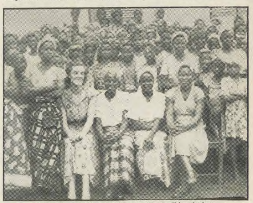
East Nigerian Mission's Women's Group, Ihie Distric t.

This quarterly women's meeting followed a general programme pattern which was much like the following: First came a period of singing, in which purely native songs and some religious ones were used. It was a