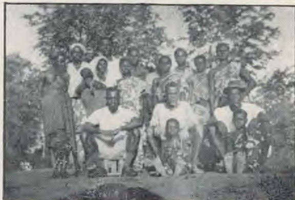
Village chief at Akonundi and new converts.

I begged the people to help me cross the river; they helped and charged me four shillings (4/-). When we crossed to the bank of the river, I gave thanks, and started to