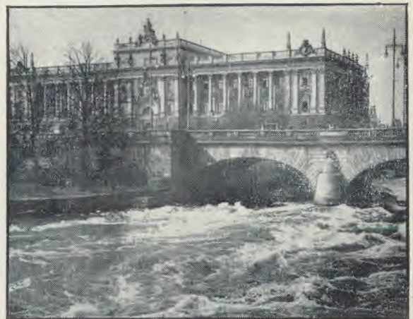
House of Parliament, Stockholm.

To accommodate the more than 2,000 youth expected, the Royal Tennis Hall in beautiful