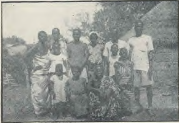
The Paramount Chief of Nangjari and new converts

converse with them. Luckily again, a young man whom I knew came to greet, then asked me to visit him one day at the village where the paramount chief lives. From that time the people began to regard me, because the young man told them that, I was a teacher to him for some years. Thus I was able to preach to the chief and his people.