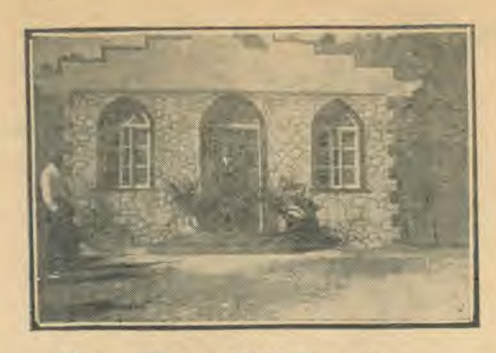
New White Hill Church

Pictured above is the beautiful little White Hill church dedicated the latter part of 1947. For some years, our earnest members in White Hill have been labouring faithfully to complete their house of worship. Now that it is fully finished and dedicated, they have a church home of which they may be justly proud.