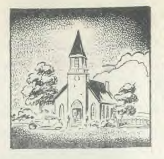
Church Building News