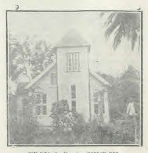
TROY S. D. A. CHURCH Pictured above is the neat little Troy church in Trelawny that was dedicated a little over a year ago. In the right foreground is our estimable Union Field Secretary who has worked so untiringly to keep the church build-

ing programme in the Union moving forward.