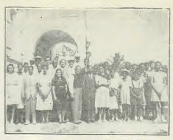
BAHAMAS COLPORTEUR ARMY

"The publishing branch of our cause has much to do with our power. I do desire that it shall accomplish all that the Lord designs it should. If our bookmen do their part faithfully, I know, from the