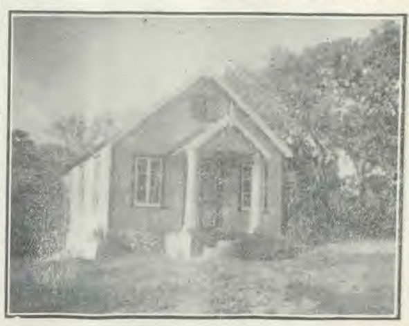
Pictured above is the oldest Seventh-day Adventist church in Jamaica - the Southfield Church in West Jamaica. Recently this neat looking church was dedicated to the honour and glory of God.