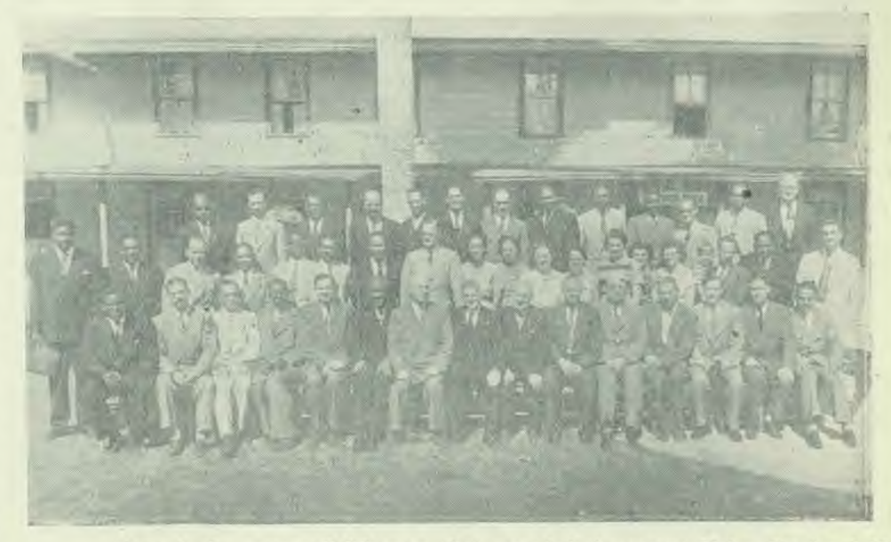
Above is the group of delegates that attended the recent Union Session held at Mandeville, Jamaica.