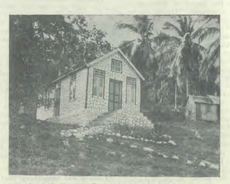
Pondside Church. One of the four churches dedicated so far this year in the West Jamaica Conference-

Our goal for 1952 is 3,000 souls for God. Our slogan is "Pentecost in '52.." With the Spirit of Pentecost burning in our souls, let us arise; cast off the partial achievements of yester years, and be clothed with the wonderful promise of the glorious march of the church of God to final triumph.