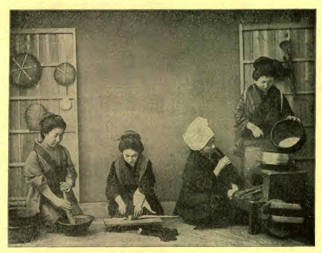
IN A JAPANESE KITCHEN

"Yes," said her mother, "it is very tough, and you could not tear it open with your fingers, even f you tried very hard. But the butterfly throws out some kind of fluid that softens the silk,—for it is a kind of silk, you know,— and makes a hole large enough to crawl through. It does not have to be very big, as the butterfly's wings are