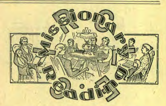
BEREAN LIBRARY STUDY

Are we like the bit of foam? Are we in the wrong, and too weak to get away? If we are not, let us remember that there are others who are, and let us do everything we can to help