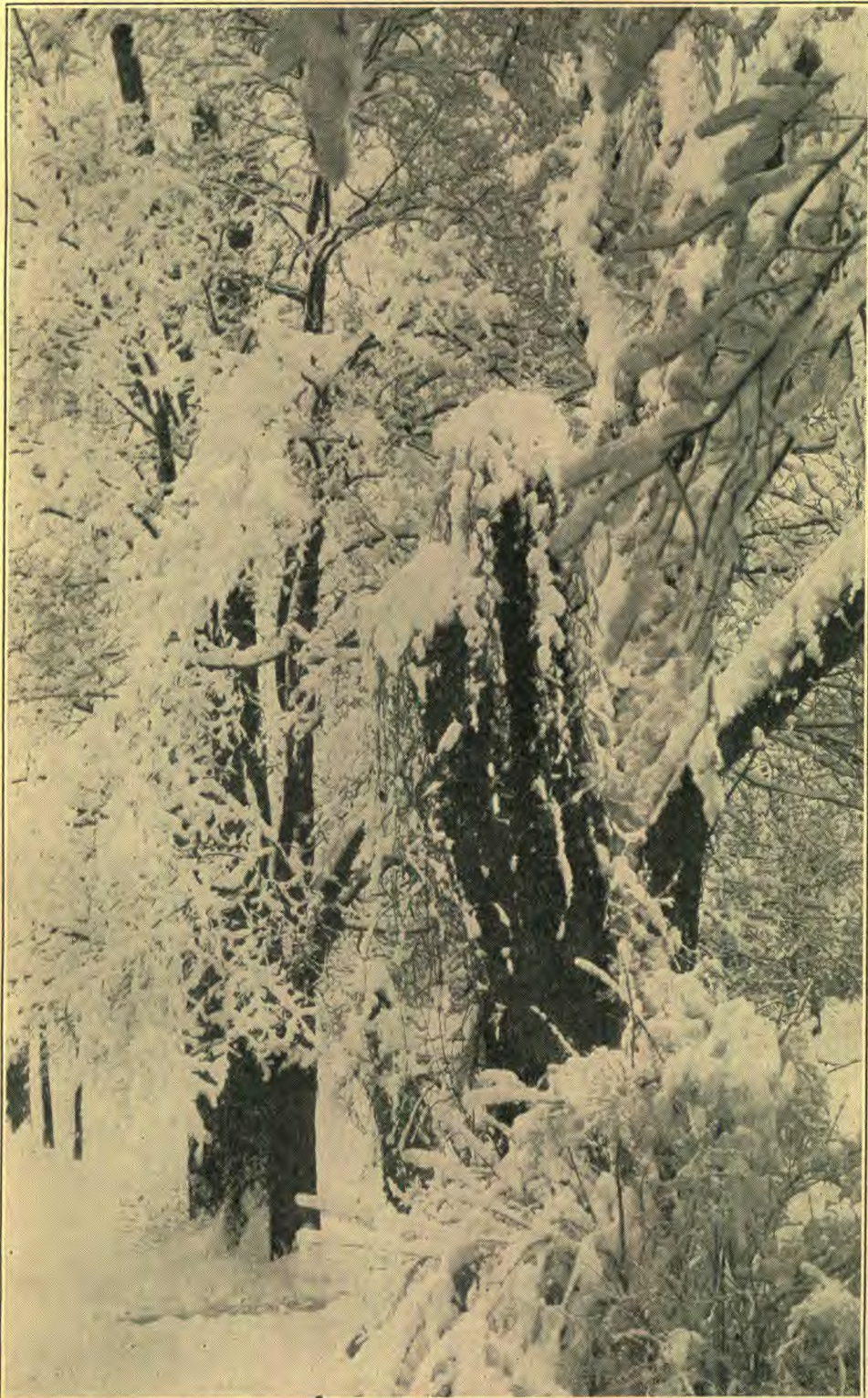
THE SILENT SNOW POSSESSED THE EARTH.—TENNYSON.