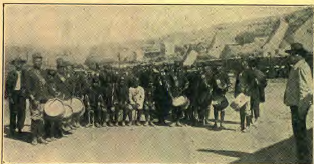
A BAND THAT TOOK PART IN THE CELEBRATION

As an example of this take, for instance, the life of Milton, the blind poet as he is called, who labored in affliction yet is ranked with the greatest of all poets.