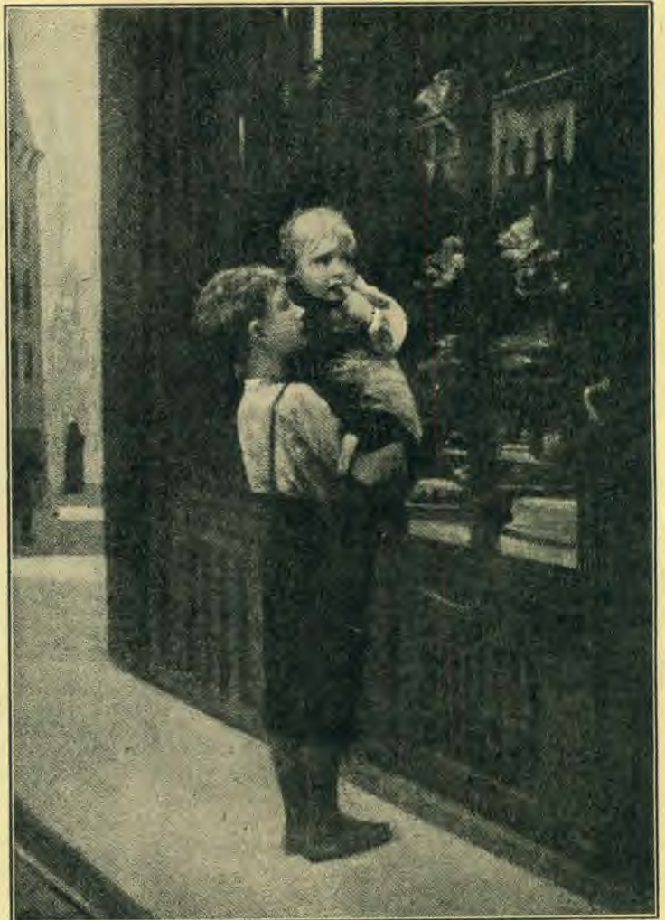
THE TEMPTING SHOP WINDOWS YIELD NOTHING TO THOUSANDS OF WISTFUL CHILDREN THIS CHRISTMASTIDE

"One is fascinated by its romantic surface, by its boldness, its cleverness, and from here it is only a step to the impulse to imitate the transgressor. It has been claimed that more than two thirds of the juvenile criminals in certain large cities have been found victims of the moving picture shows. . . . Perhaps the worst feature is the utter triviality and cheapness of most photoplays. The cultural level on which they move is that of the gossip. . . . All the regrettable features of the lower type of newspapers are repeated