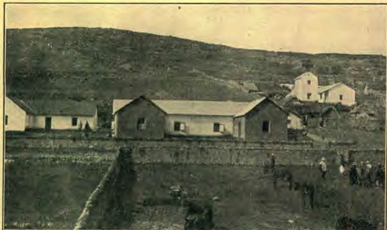
PLATERIA MISSION WHERE THE CELEBRATION TOOK PLACE