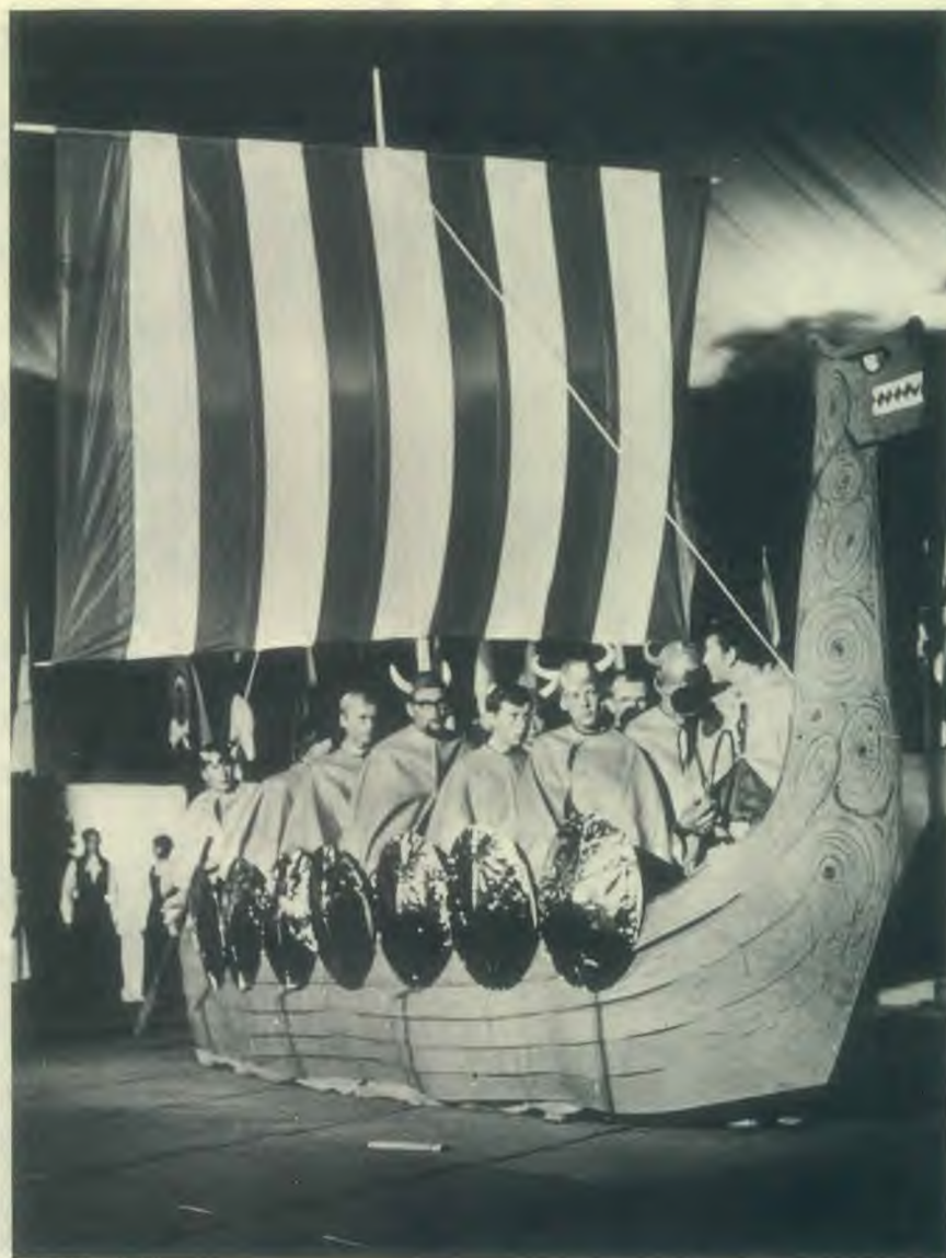
Youth from the Northern European Division enact the parts of sailing Norsemen.