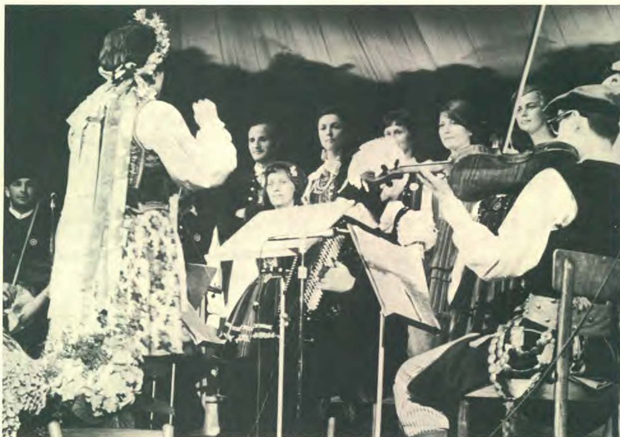
Music by the Czechoslovakian choir and orchestra was an important and stimulating part of this country's contribution.

box. Men and women were depositing coins and getting tickets.