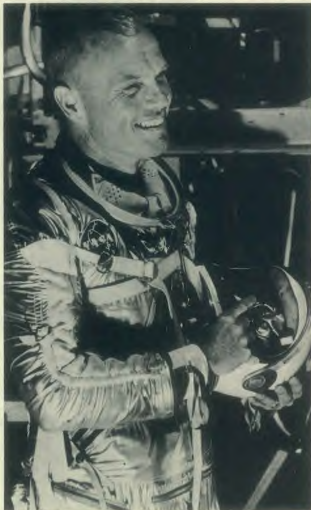
Project Mercury Astronaut John H. Glenn, dressed in pressure suit, before entering Alfa trainer at Langley Air Force Base, Virginia.

Again: "Motives stronger, and agencies more powerful, could never be brought into operation; the exceeding rewards for right-doing, the enjoyment