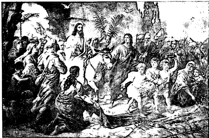
Triumphal Entry Into Jerusalem