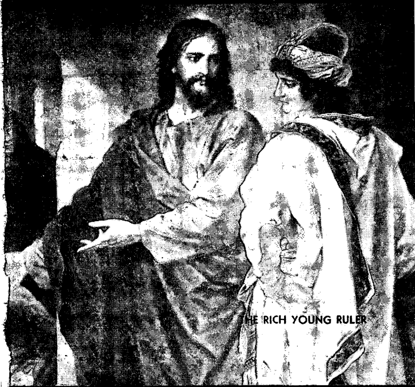
THE RICH YOUNG RULER