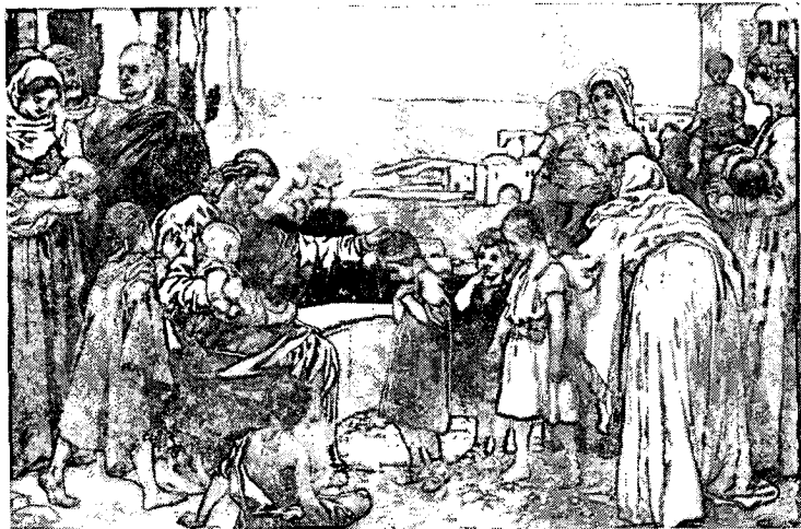
Christ Blessing Little Children

11. What was the result of these two prayers? With what great principle of truth did Jesus close this parable? Luke 18:14.