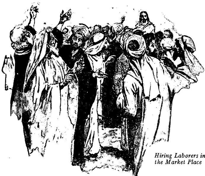
Hiring Laborers in the Market Place

far better than themselves. Selfishness can never enter heaven. This parable teaches also that eternal life is not earned, but bestowed out of the grace and love in the heart of the Giver.