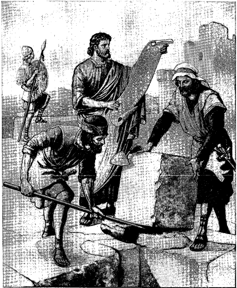
Nehemiah Rebuilding the Walls of Jerusalem