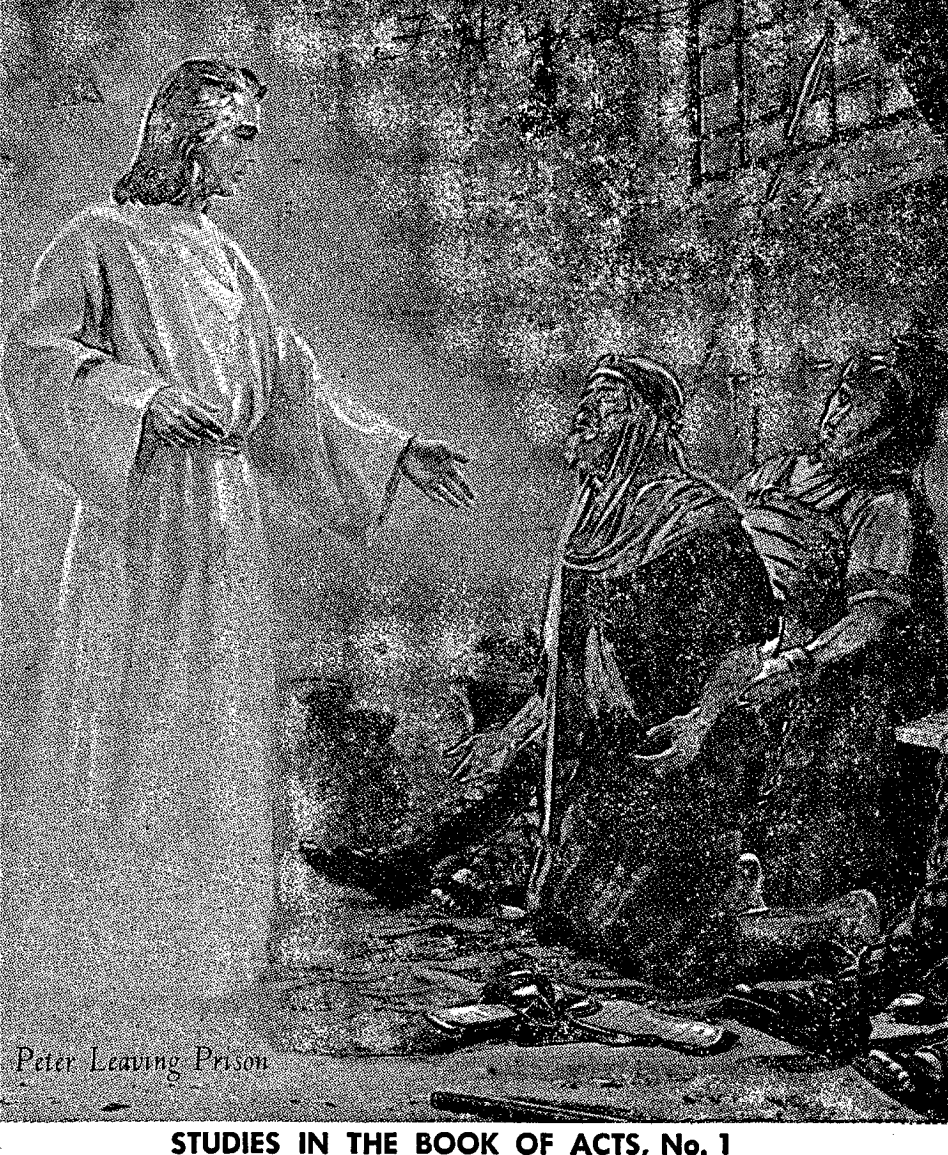
STUDIES IN THE BOOK OF ACTS, No. 1