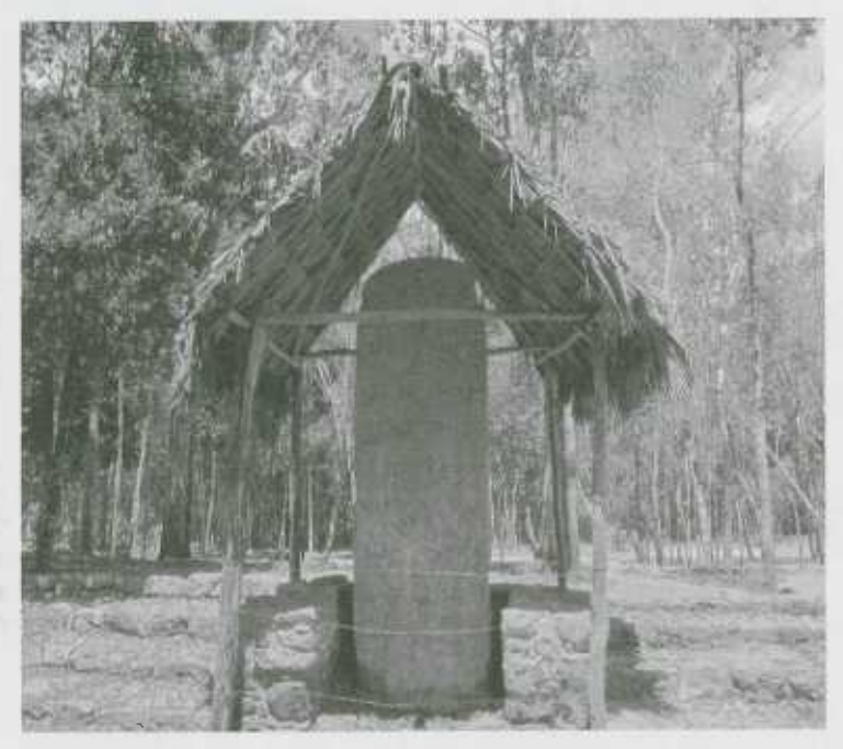
Figure 7. Stela 2 at Coba.

México, have very interesting inscriptions. [See figure 7] Both mention the creation date (13.0.0.0.0) but prefixed by 19 units of 13. This means that the creation date was in fact an abbreviation of a still longer date. This equals 8,285,978,483,664,581,446,157,328,238.631 years of elapsed time from the true beginning of time in Maya conception of the cosmos. That is 28 octillion years in the past. Now, if we extend to the future, the Maya Calendar projects 43 octillion years (43,517,152,096,098,311,708,523,306, 538). That is well beyond the time that according to scientific calculations our sun will cease to exist.<sup>52</sup>