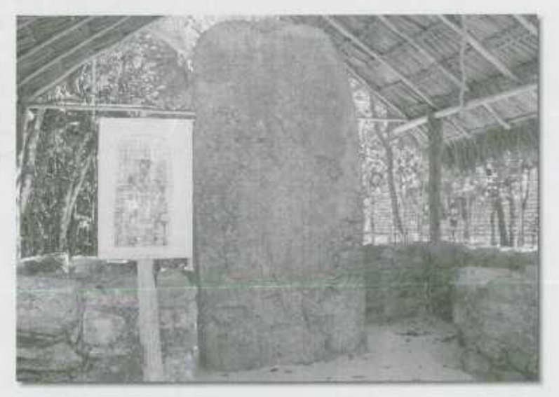
Figure 6. Stela 1 at Coba.

5. Maya believed that the world existed before 3114 B.C. and would continue to exist after A.D. 2012. The Long Count date of December 21, 2012, is 13.0.0.0. Did the Mayas expect further events after that date and/or how would they record these events? The Long Count Maya calendar works like the odometer of a car. The date 13.0.0.0.0 will be also 0.0.0.0.0 and will mark the beginning of a new cycle. The Stela 1 at Cobá also shows that Maya would add an extra digit indicating the beginning of a new age in the calendar. [See figure 6] Thus, December 22, 2012 will be simply 1.0.0.0.1 and it would continue as time marched indefinitely. Did the Mayas expect events to happen after this date? Yes, they did. One glyphic text in the Temple of the Inscription at Palenque, Chiapas, celebrated that the 80th round calendar anniversary of the reign of the great king K'inich Janaab' Pakal (known as Pakal) would take place eight days after the end of a 8,000-year Long Count cycle called the pictun. This refers to October A.D. 4772, almost three millennia after 2012. Evidently, the Mayas did not believe that the world would end in 2012.