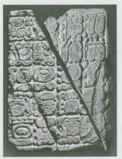
Figure 1. Monument 6, El Tortuguero, Tabasco, Mexico

The thirteenth calendrical cycle will end on the day 4 ahau, the third of Uniiw, when there will occur blackness (or a spectacle) and the God of the Nine will come down to the red (or be displayed in a great investiture).<sup>11</sup>