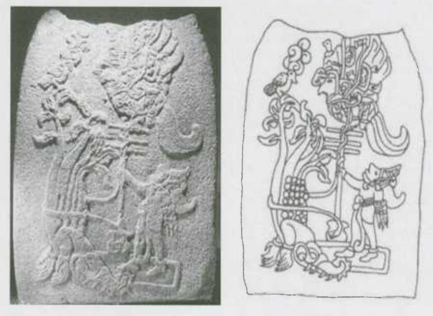
Figure 2. Stela 25 at Izapa, Chiapas, Mexico

John Major Jenkins, a prominent author of books about the Maya Calendar and 2012, argues that an important key is the image in the stela 25 at Izapa, a site in Chiapas, Mexico. The man in the image is interpreted to be one of the Hero Twins who in Maya creation Mythology shoots a bird deity named Seven Macaw with a blowgun in order to usher in the transition from one world creation to the next. The caiman in the picture is the Milky Way (the spots in the back are stars), the polar center is at the top and the Seven Macaw is the Big Dipper constellation. All are aligned in the way the sky looked in the summer solstice when the stela was erected (600–100 B.C.). It is argued that this is a dateless reference to creation in 3114, and, therefore, recreation in 2012.<sup>13</sup>.