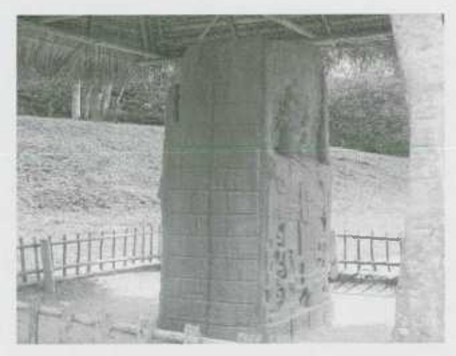
Figure 4. Stela C, Quiriguá Guatemala.

Similarly, the impressive Stela C in Quiriguá (southeast Guatemala) affirms that the kingship of Cauac Sky (A.D. 724–785) was rooted in the moment of the most recent creation 13.0.0.0 (3114 B.C.). [See Figure 4]