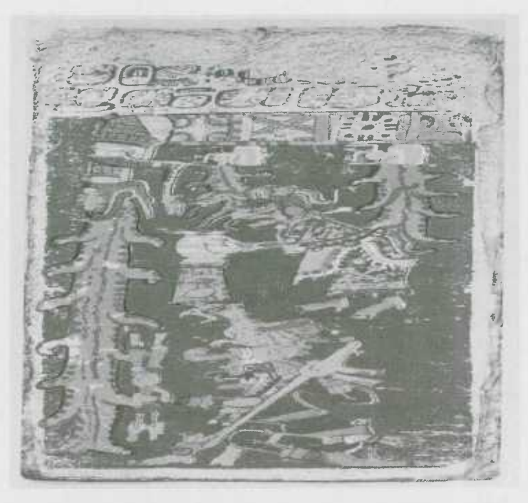
Figure 5. Last page of the Dresden Codex

This takes us back to Tortuguero's Monument 6. Using the information gathered from Maya inscriptions here and there and a diversity of Mesoamerican traditions, the stone tablet has been read in the following way (notice the interpretation in the bracketed text):