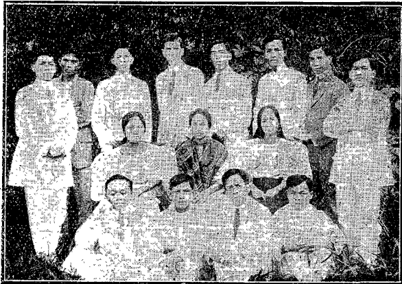
Workers Employed in Manila Printing House