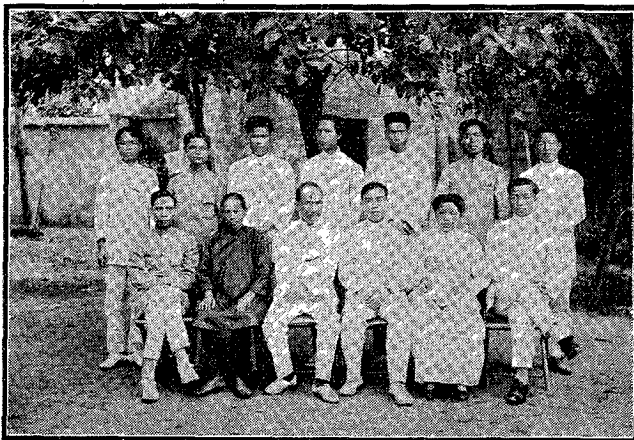
CLASS OF CHINESE IN SINGAPORE TRAINING SCHOOL

safety as the words of an authority, and are of deepest significance, as this is probably the first ruling of the supreme court in favor of the Seventh-day Adventists, recognizing their right to rest the seventh day, and labor six days, according to the commandment, without the interference of their fellowmen."