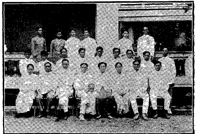
MALAY CLASS OF SINGAPORE TRAINING SCHOOL