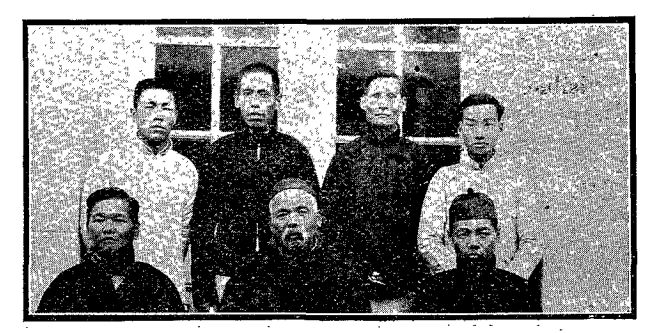
Students of the Foothow school in training for evangelical work, and their teacher.