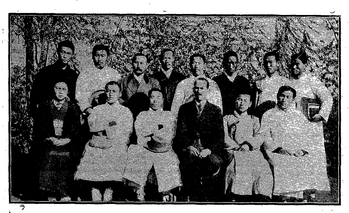
The Faculty of Our Soonan 'Korea' Industrial Training school

"Our educational institutions can do much toward meeting the demand for trained workers for these mission fields. Wise plans should be laid to strengthen the work done in our training-centers. Study should be given to the best methods for fitting consecrated young men and women to bear responsibility and to win souls for Christ. They should be taught how to meet the people, and how to present the third angel's message in an attractive manner."