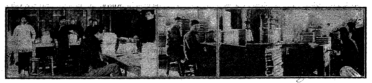
GLIMPSES OF THE BINDERY OF OUR SHANGHAI (CHINA) PUBLISHING HOUSE

For our Sabbath-school offering, we have set our aim at one cent a day for each church member. In January we lacked a little of raising a half cent a day. I drew a picture of a cent on an inclined plane. I drew several people; some were lifting with all their might, some were lifting a little, some were pushing some one else, and several were doing nothing but standing around. A sign-board at the top pointed up and away, and on it, in Chinese, were the words: "This is the way to save the heathen." In the corner, in Chinese characters, were the words: "Some doing their best; some doing a little; some doing nothing; which one are you?" I hung this