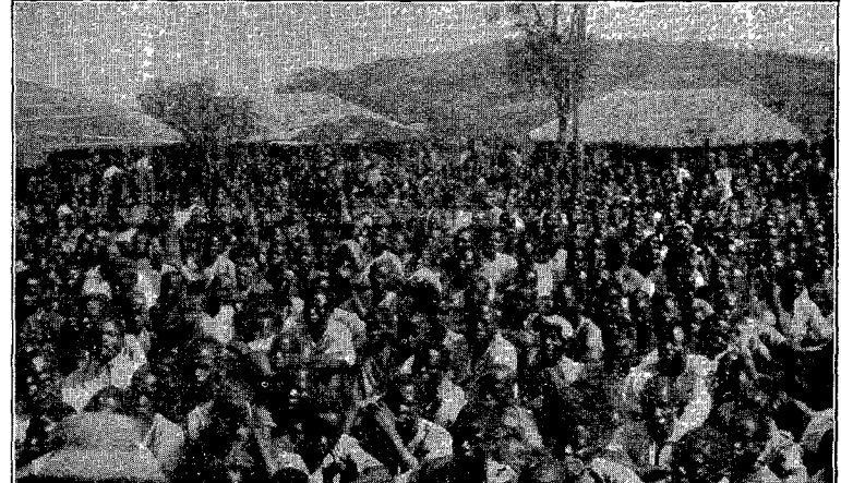
LISTENING TO THE GOSPEL IN NYASALAND - 1800 PRESENT

"Our Story of Mis-sions" the following interesting narrative of the beginning and growth of our work from 1874: