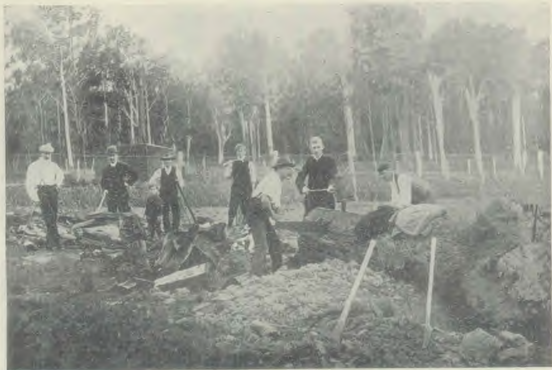
An Outdoor Gymnasium.