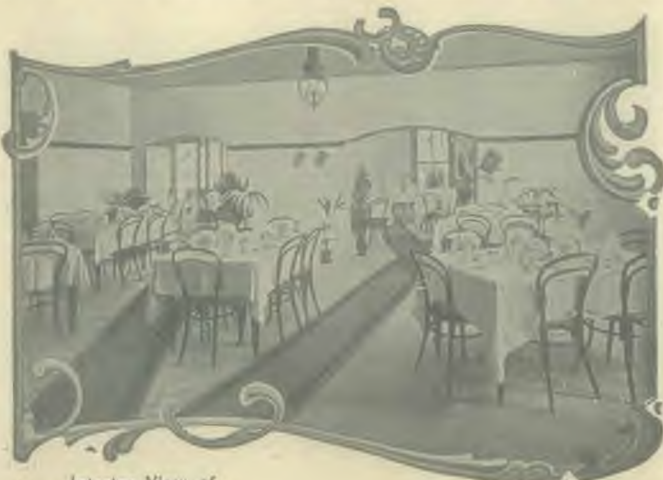
Interior View of Dining Room.

Where All Foods Advocated by this Journal Can be Obtained.