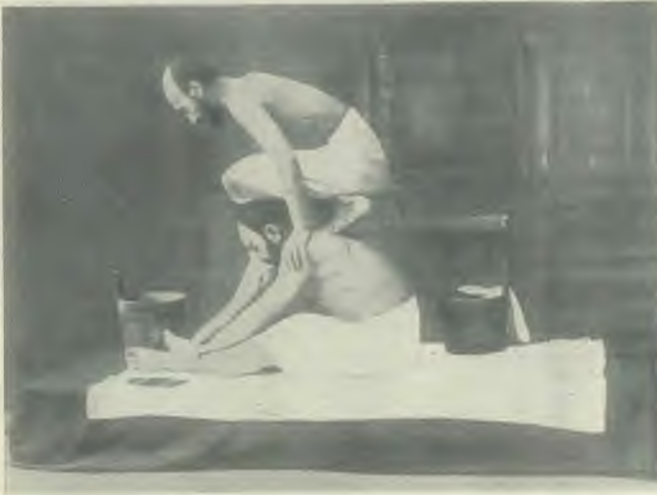
One Procedure of a Persian Masseur.

When the blood is healthy, the cells of which the body is composed are vigorous