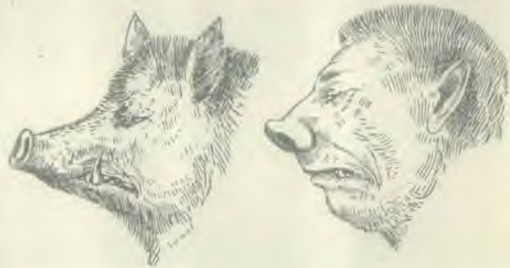
"He who eats pig becomes piggified."

In a measure, through perverse habits handed down from generation to generation, we have overcome our natural repugnance to the eating of dead bodies, but that repugnance still survives beneath the surface. Who would be willing to slay a creature,