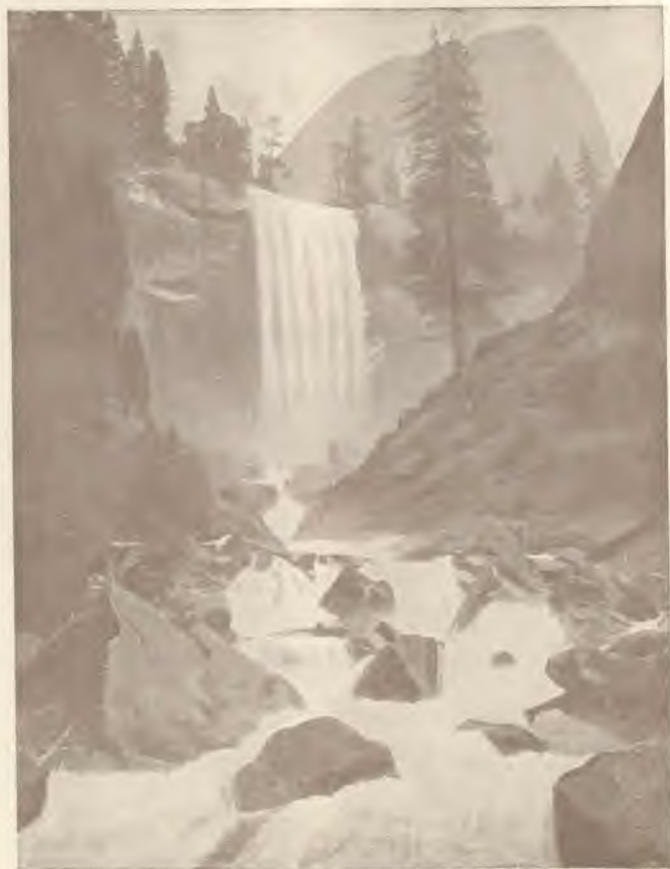
A Mountain Torrent.

Registered at the General Post Office, Sydney, for transmission by Post as a Newspaper.