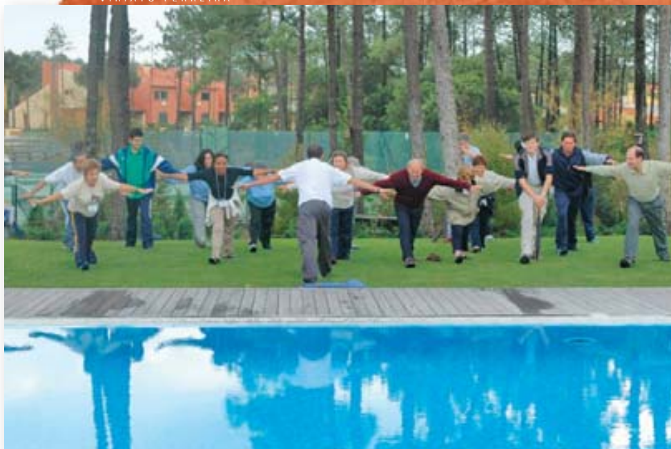
TAKE FLIGHT: Participants in a New Start program get ready to "take off" to a healthier life.