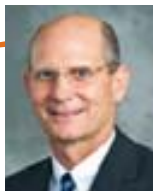
Ted N. C. Wilson is president of the General Conference of Seventh-day Adventists.