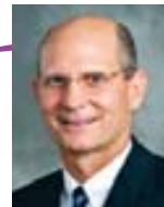
Ted N. C. Wilson is president of the Seventh-day Adventist Church.

“Let none entertain the thought that we can dispense with organization. . . . In the name of the Lord I declare to you that it is to stand,