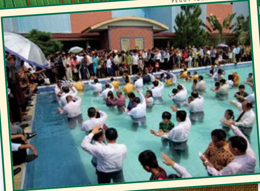
A MOMENTOUS EVENT: Almost 2,000 people were baptized as a result of the evangelistic meetings in Manado.

The highlight of our day was the baptism of the island chief. Throughout the meetings the chief's faith has strengthened. He made his commitment to Jesus, and today he, his wife, two of his children, and two of his grandchildren were baptized. It was a glorious outdoor service. The chief sent a letter to his entire large village explaining that he is now a Seventh-day Adventist and inviting them to consider the truths he has accepted. While videotaping his baptism, the chief looked into the camera and committed himself to lead his people into an understanding of God's message of truth for these last days, and is encouraging the Seventh-day Adventist Church to send missionaries to help him.