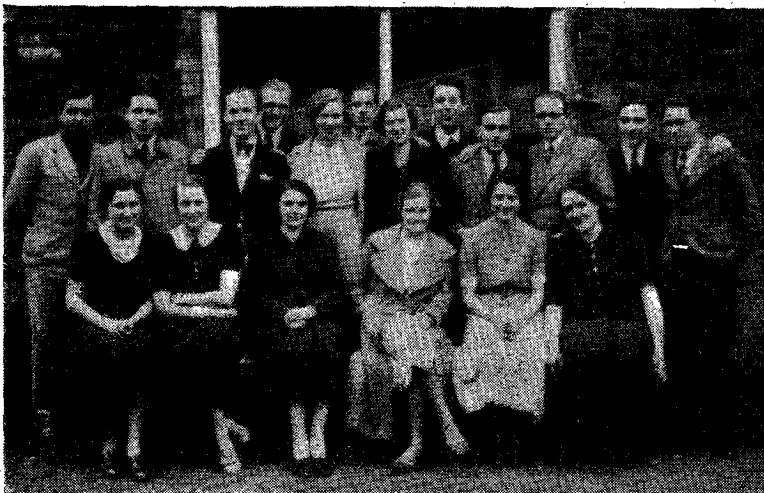
Newbold leather workers.

Although the bags we produced during 1938 have proved such good sellers, we are looking forward to an even better sale this year and intend to produce again our zip shopping bags, pyjama cases, collar-and-tie cases, kiddies' hand-